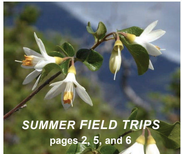
Styrax redivivus, Nomlaki Trail II, April 24, 2016

Saving our precious and endangered natural environment requires legislators who regard conservation as a priority, not something to be attended to when it is politically convenient. Your vote will help.