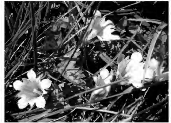
Sierra alpine gentian ( Gentiana newberryi var. tiogana) Kings Creek Meadow, Lassen Volcanic National Park September 10, 2017

The attention shifted to trees as we reached the top of the rise above Cold Boiling Lake. In response to a question, we discussed the trees growing there, and how to tell the difference between a mountain hemlock ( Tsuga mertensiana ), a red fir ( Abies magnifica ) and lodgepole pine ( Pinus contorta ssp. murrayana ). The lodgepole appeared to compete in size with the signed "Champion Lodgepole Pine" we observed at Brady's Camp.