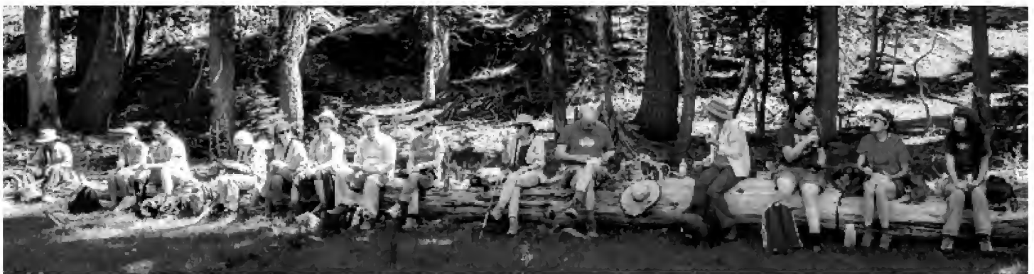
Crumbaugh Lake, Lassen Volcanic National Park September 10, 2017

Although there was much interest in plants and blooms, it appeared to this leader the high point of the day for many were the cookies!