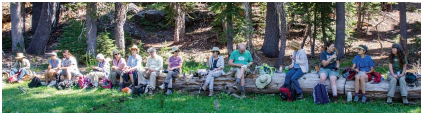
Crumbaugh Lake, Lassen Volcanic National Park September 10, 2017

Although there was much interest in plants and blooms, it appeared to this leader the high point of the day for many were the cookies!