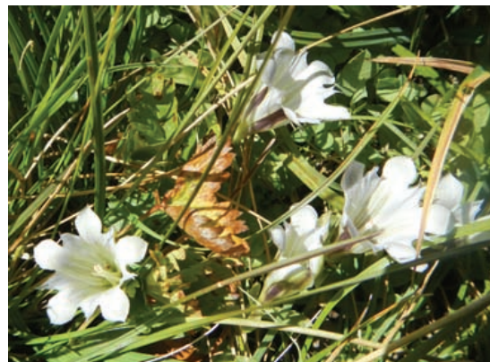
Sierra alpine gentian ( Gentiana newberryi var. tiogana) Kings Creek Meadow, Lassen Volcanic National Park September 10, 2017

The attention shifted to trees as we reached the top of the rise above Cold Boiling Lake. In response to a question, we discussed the trees growing there, and how to tell the difference between a mountain hemlock ( Tsuga mertensiana ), a red fir ( Abies magnifica ) and lodgepole pine ( Pinus contorta ssp. murrayana ). The lodgepole appeared to compete in size with the signed "Champion Lodgepole Pine" we observed at Brady's Camp.