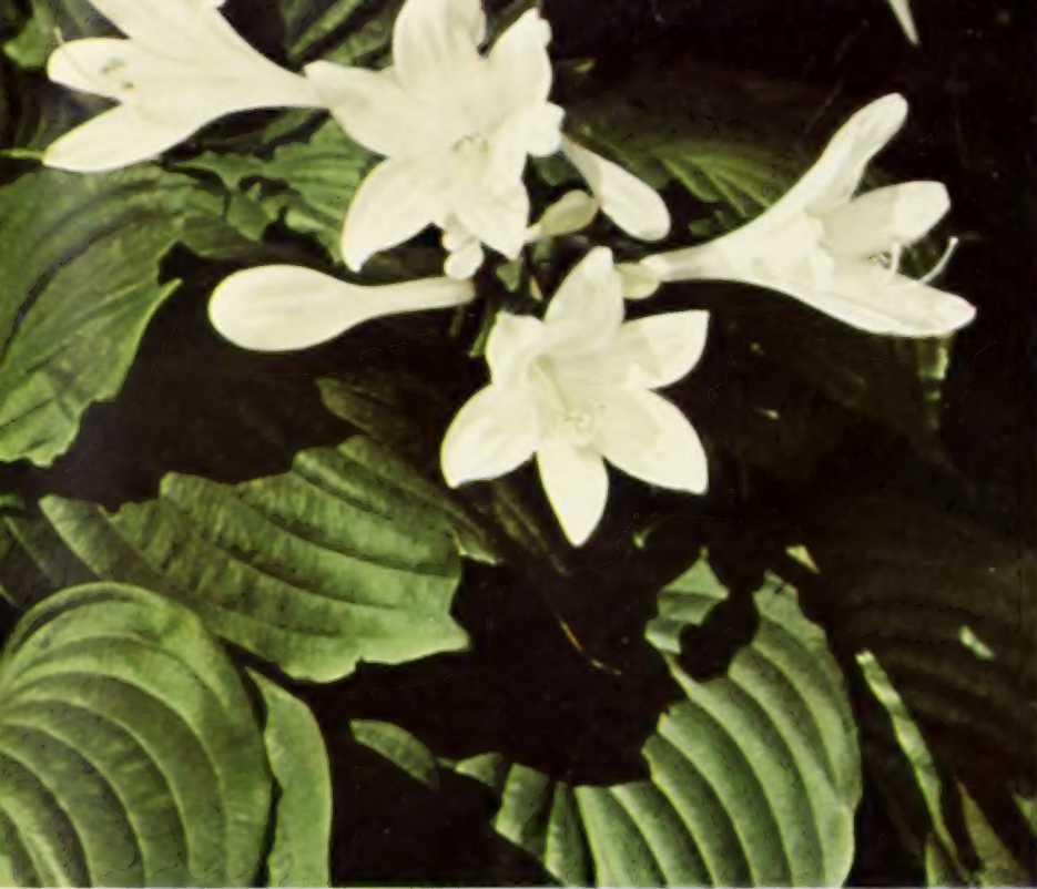
FUNKIA GRANDIFLORA ALBA