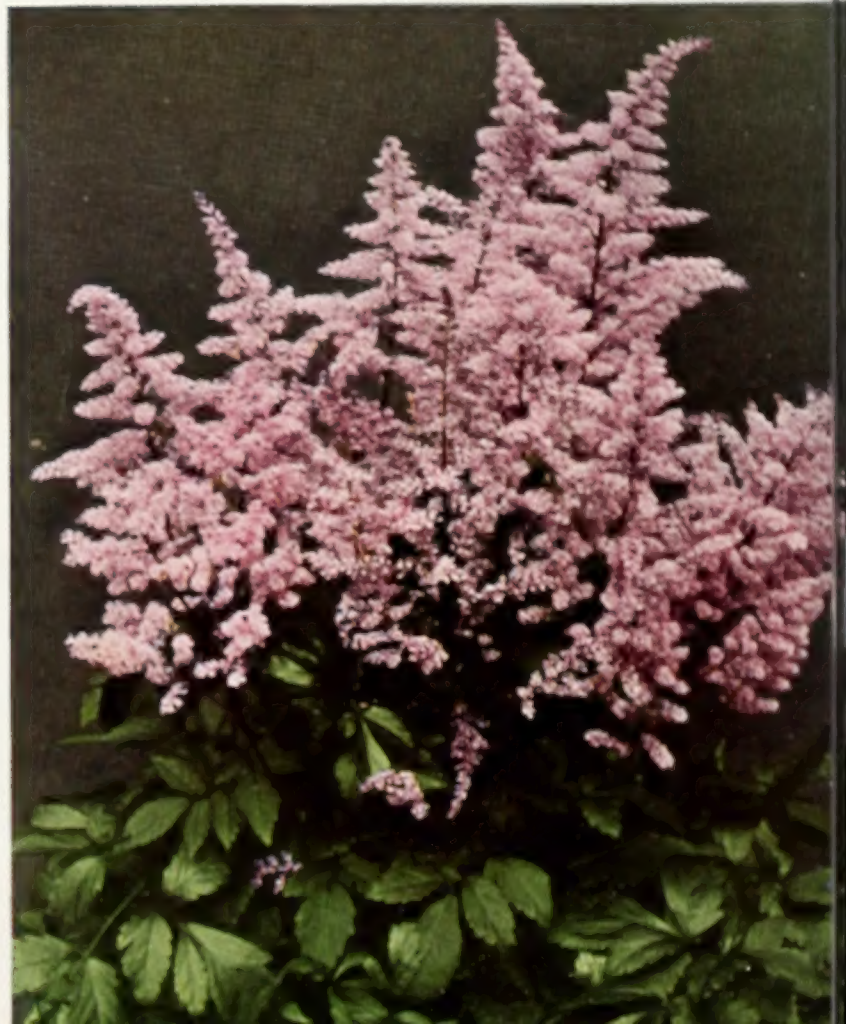
ASTILBE, PEACH BLOSSOM