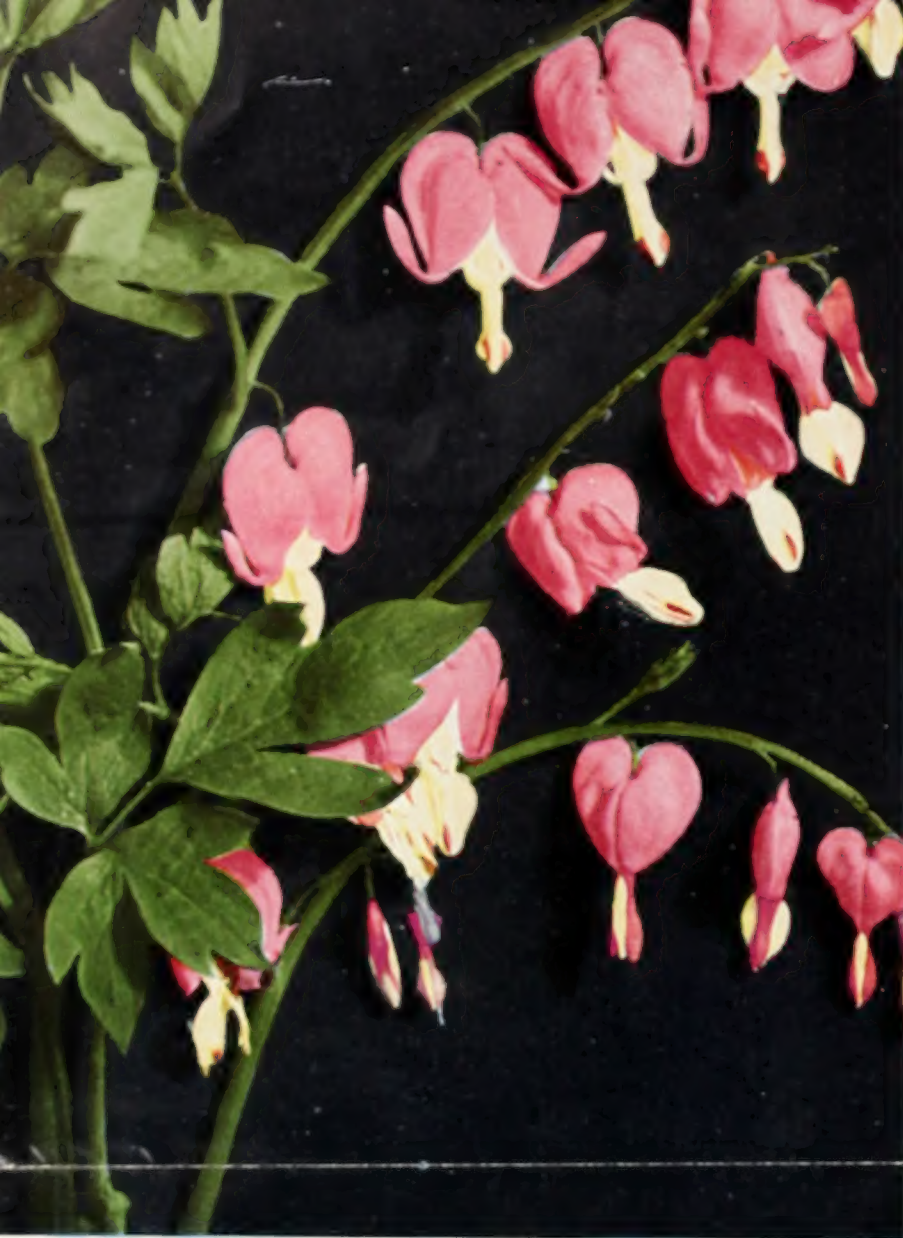
DICENTRA SPECTABILIS ASTILBE, FANAL