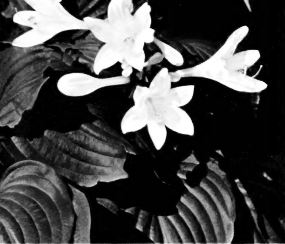
FUNKIA GRANDIFLORA ALBA