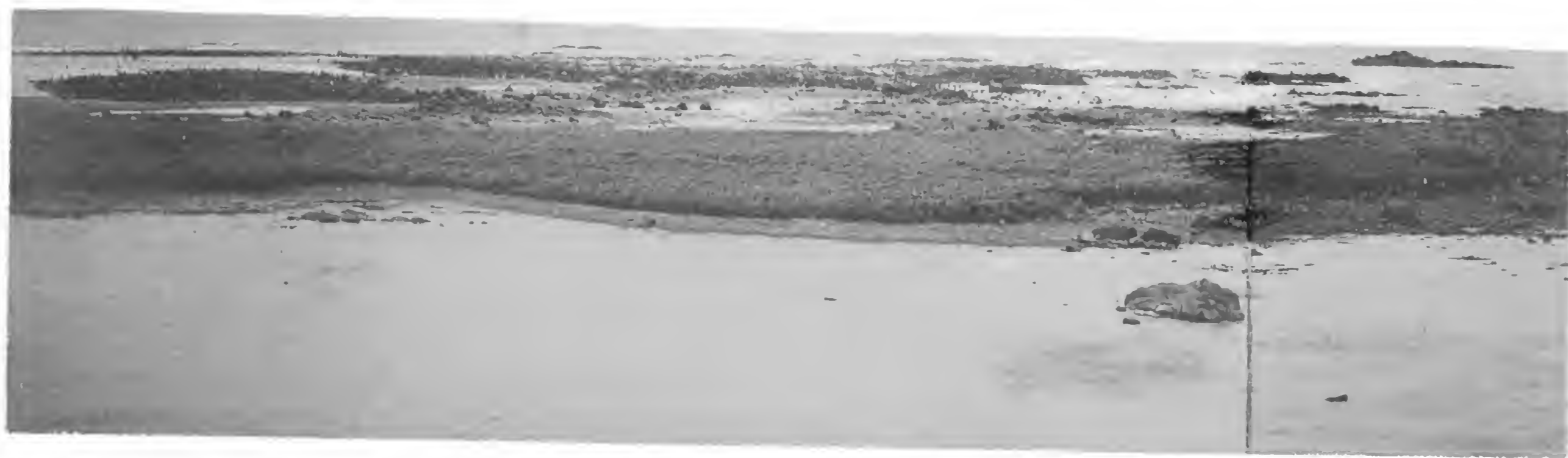
Plate 34. - Reef, North Rookery, Bering Island, July 4, 1895, about 2 p. m. Breeding seals in three disconnected patches to the left of picture.