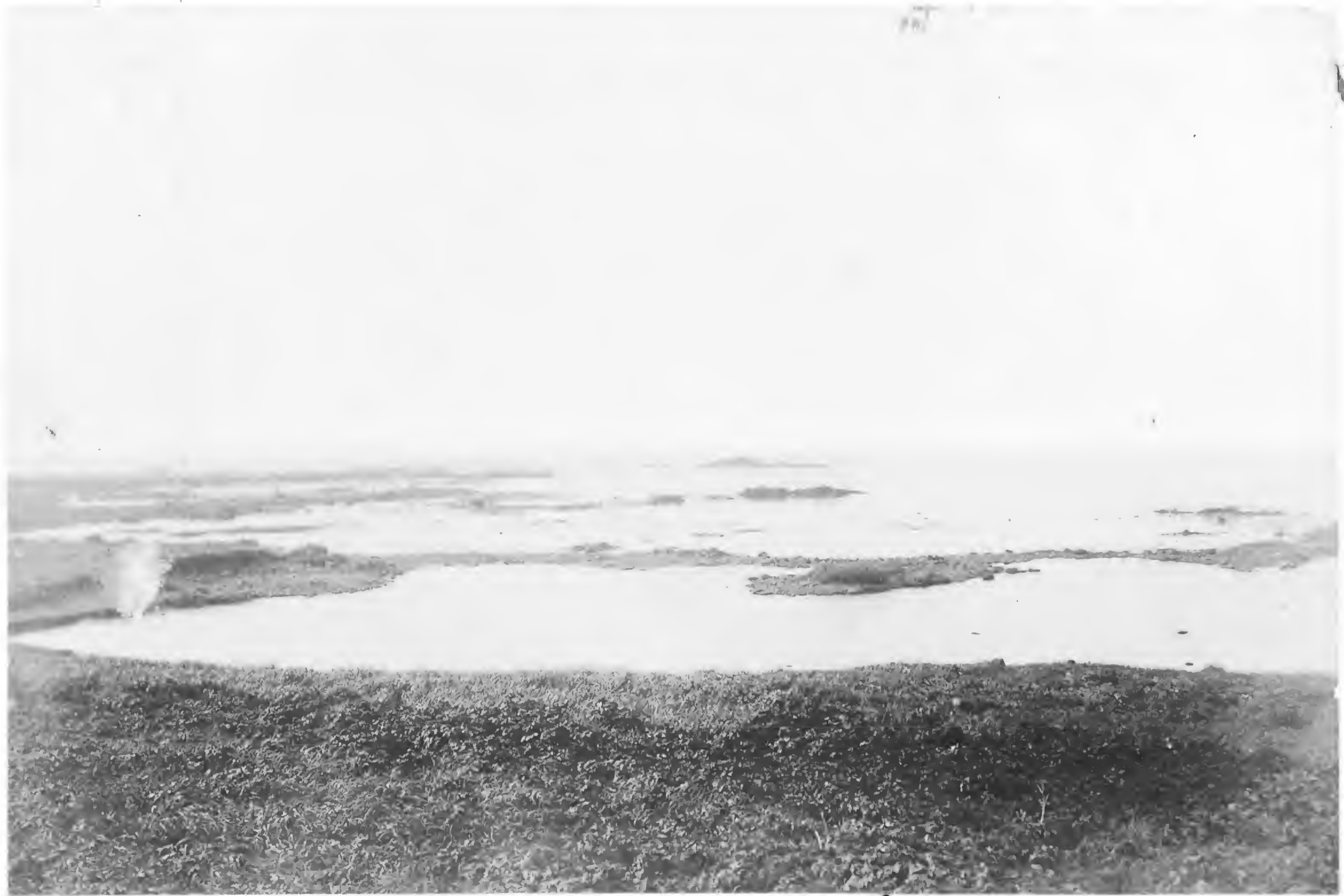
Plate 26.- Reef and Divided Beach, near ... Reef, ... Island, supplement ...