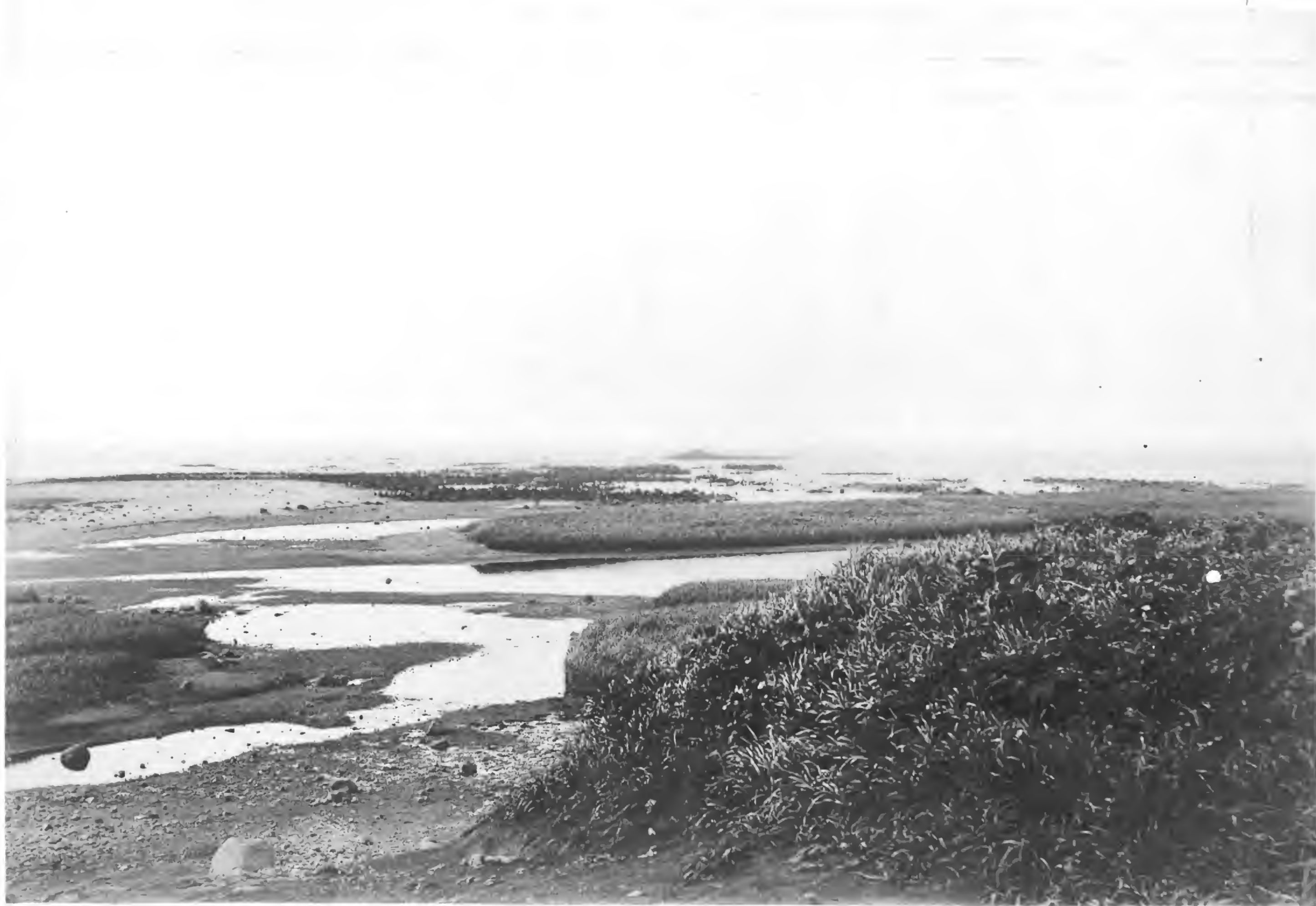
29. - Beach and dunes - [unclear]