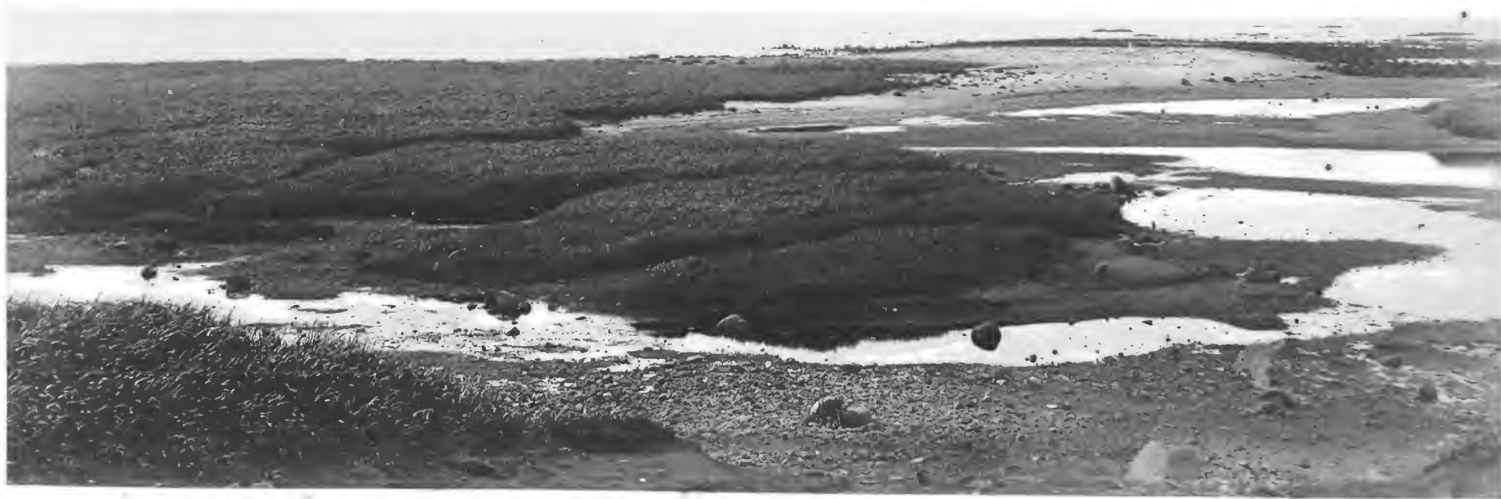
Looking over the marsh, south of the lagoon, from the cove-way, July 15, 1901, 4.50 p. m., showing plants of reeds in the water.

Omit outside of the lens no other objection