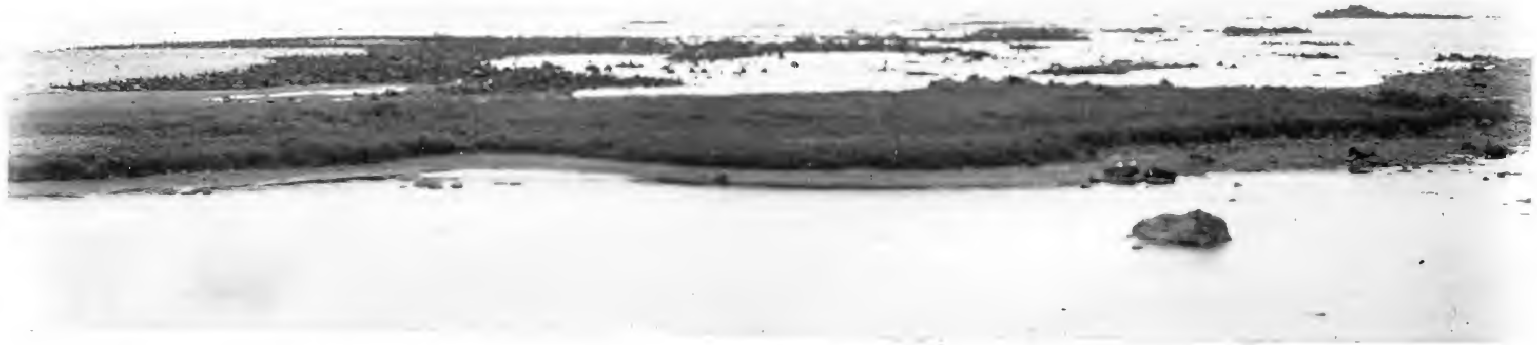
PLATE 35.- SCENE FROM THE BERING SEA, 5 p. m.

Taken from the ship "Ural", showing the broad flat, open sea and continuous area; also the "land" beyond the "seals".