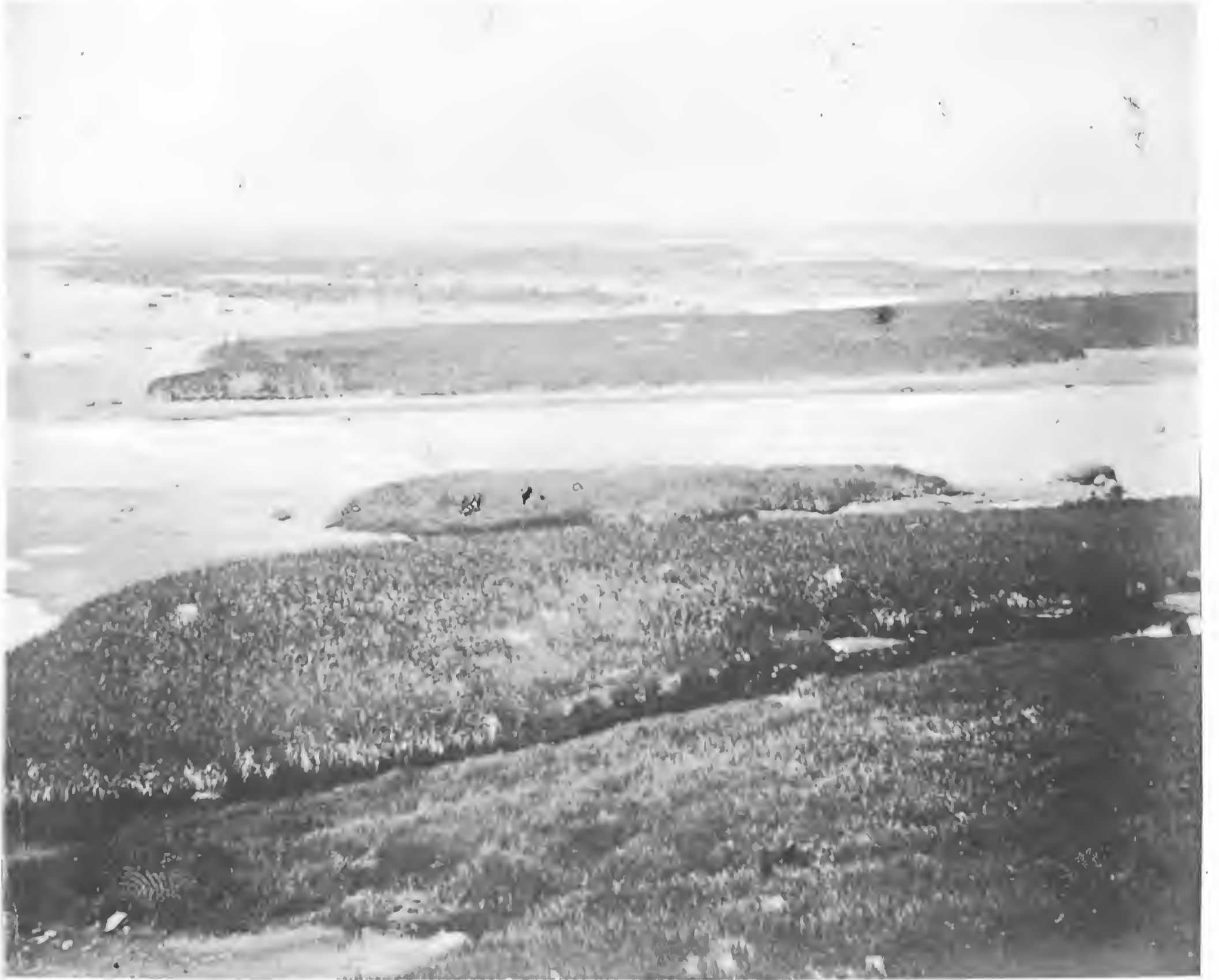
Plate 27. - Roof of Sivatchi Lagoon, North Rookery, Berlin Island. Photographed by Col. Voloshinov, 1885. From nearly same point as pl. 24, with which it should be compared for distribution of seals on breeding ground.