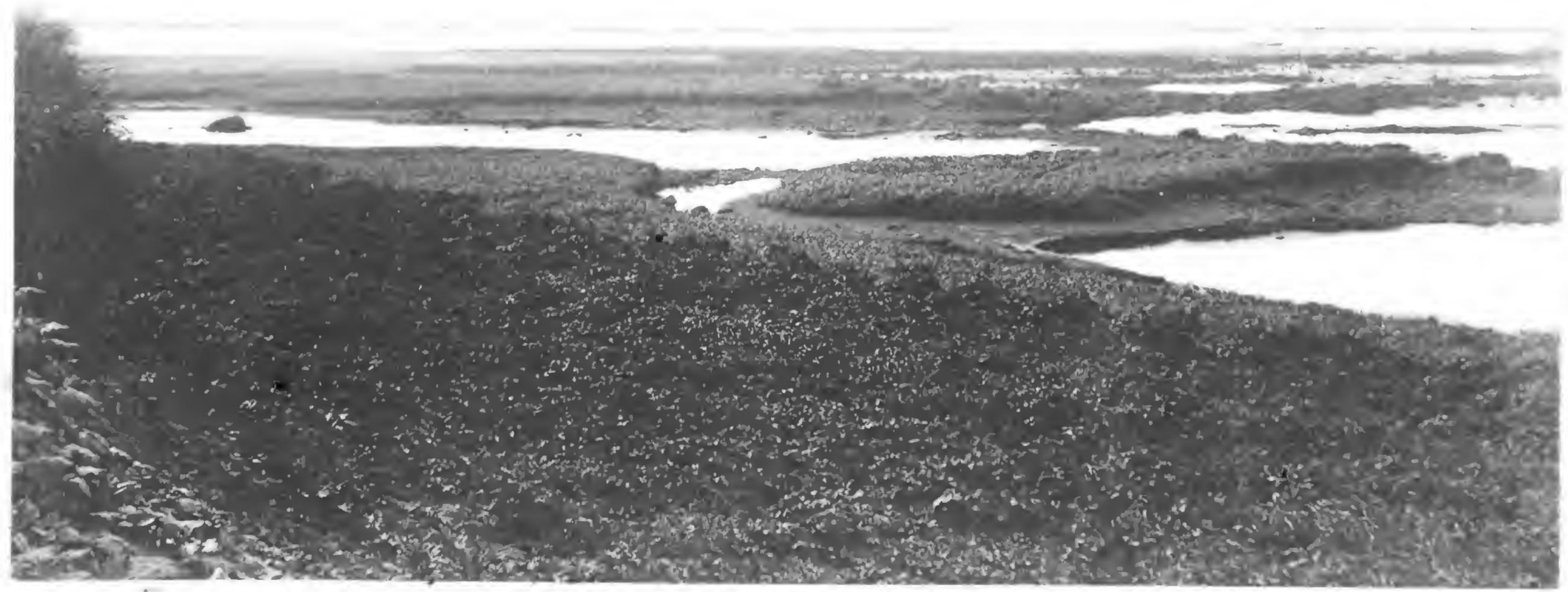
Plate 25. - [faded text]

[faded text] to start [faded] seals as compared with