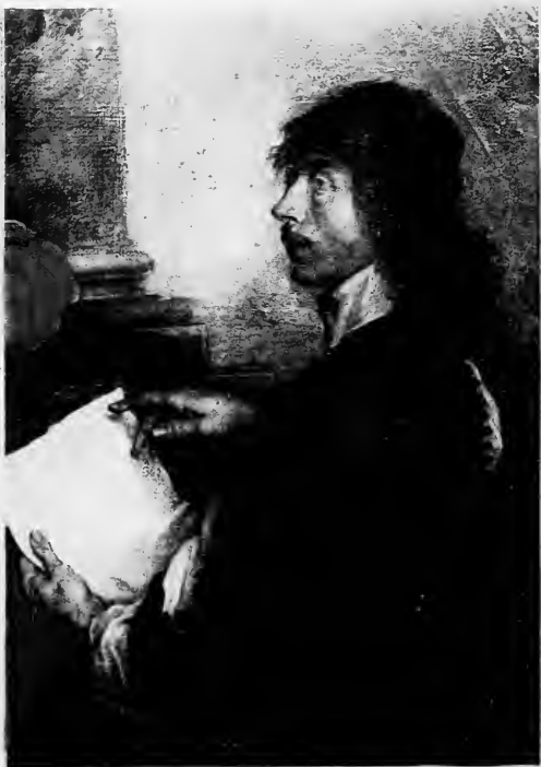
Thomas Carew from the Picture by Vandyke at Windsor Castle photographed by permission of Her Majesty the Queen.