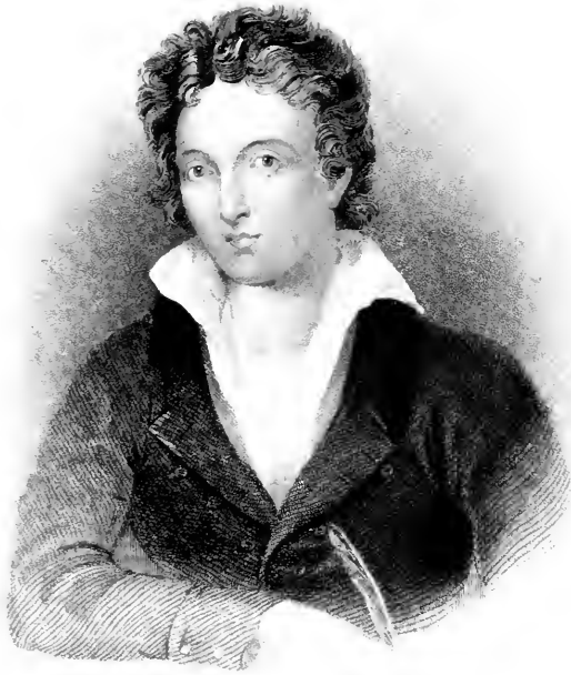
Percy B. Shelley.