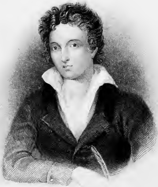
Percy B. Shelley.