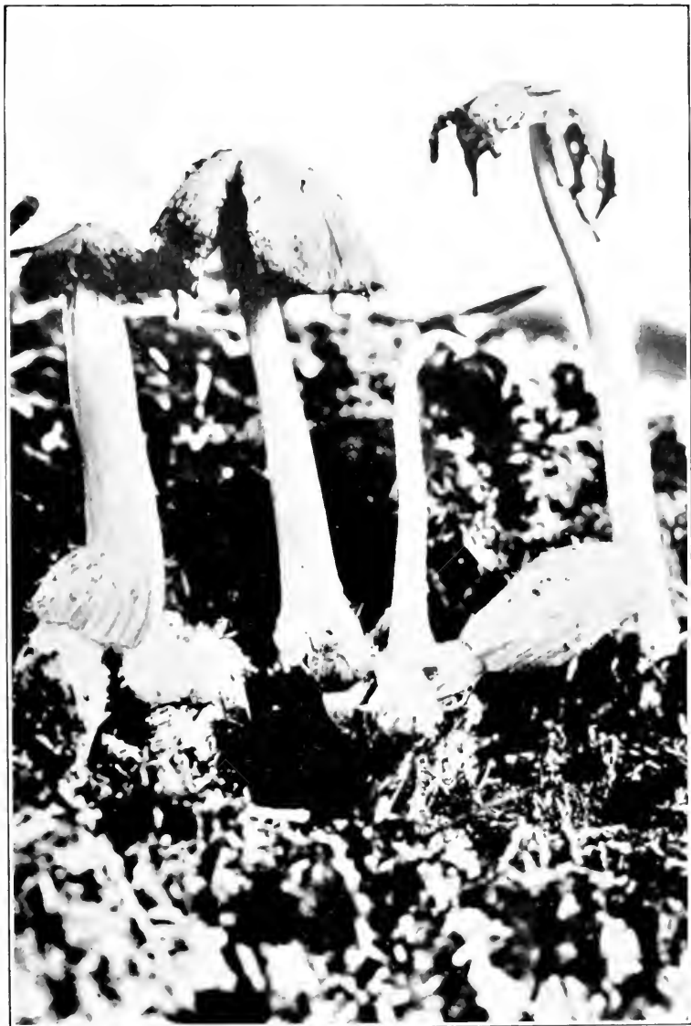
COPRINUS CONFERTUS COPELAND.