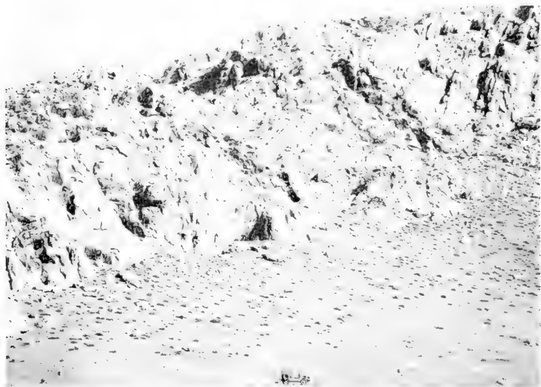
Fig. 2. The hillside and cliff at Warwasi, where living snails were collected in April of 1960. The Paleolithic archeological site of Warwasi is the dark overhang at the base of the cliff, almost directly above the car.

4. Shells of Helix salomonica were found in great numbers in an archeological site (Tepe Sarab) located in the open Ker-