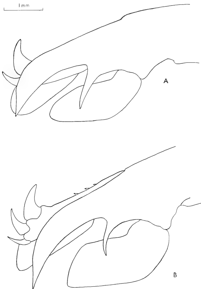
Figure 2. A. G. brevisquamatus Paulson, Red Sea, ventral view of right uropod; B. G. fimbriatus Lenz, Zanzibar, ventral view of right uropod. Smaller lateral spines present in both species; they are obscured by the basal prolongation in 2A.

of the outer branch tapers and the inner branch is truncate distally. Both are similar in lateral spination of the proximal segment of the outer branch. The inner spine of the basal prolongation is comparatively longer in G. brevisquamatus . Both species have a pair of short submedian carinae on the ventral surface; these carinae converge anteriorly but do not meet.