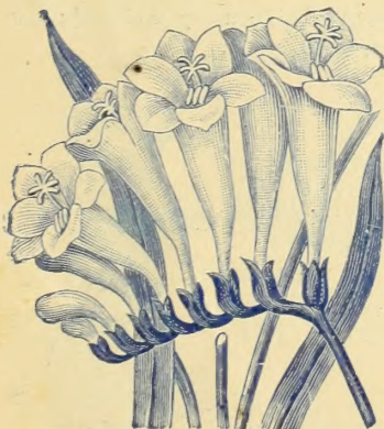
FREESIA REFRACTA ALBA.