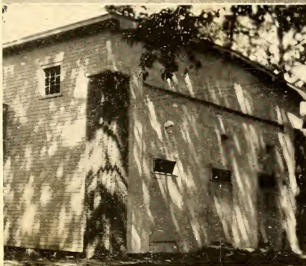
ADMINISTRATION BUILDING GYMNASIUM