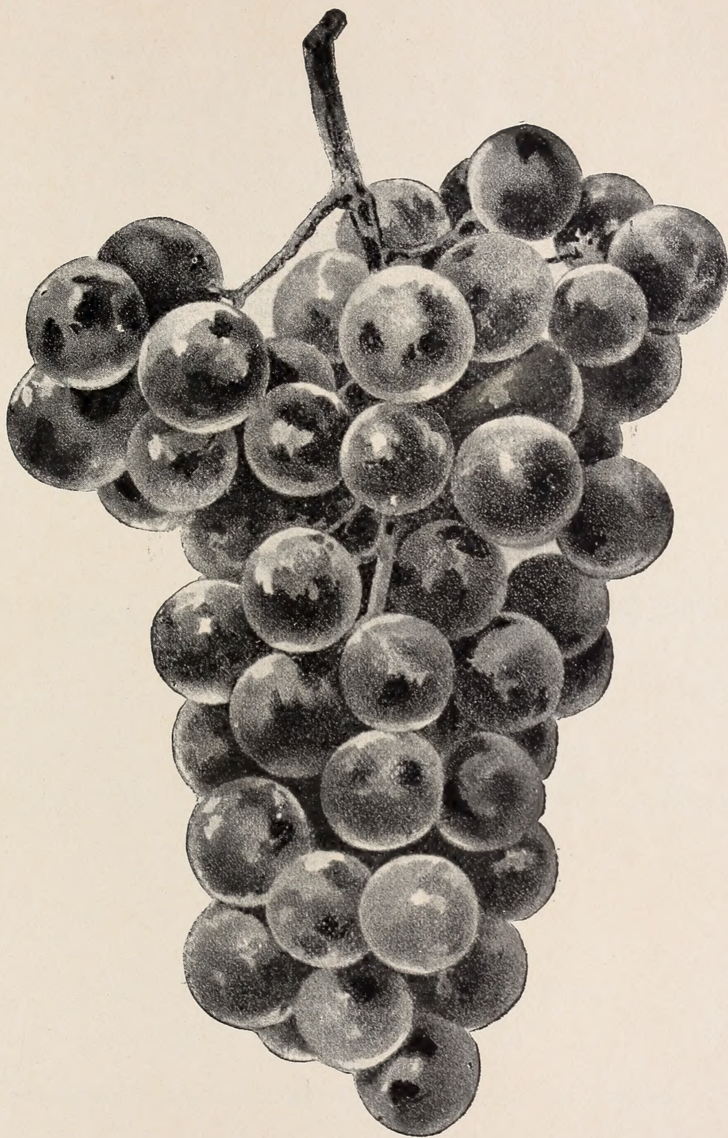
THE NEW AMERICAN GRAPE, THE PIERCE.