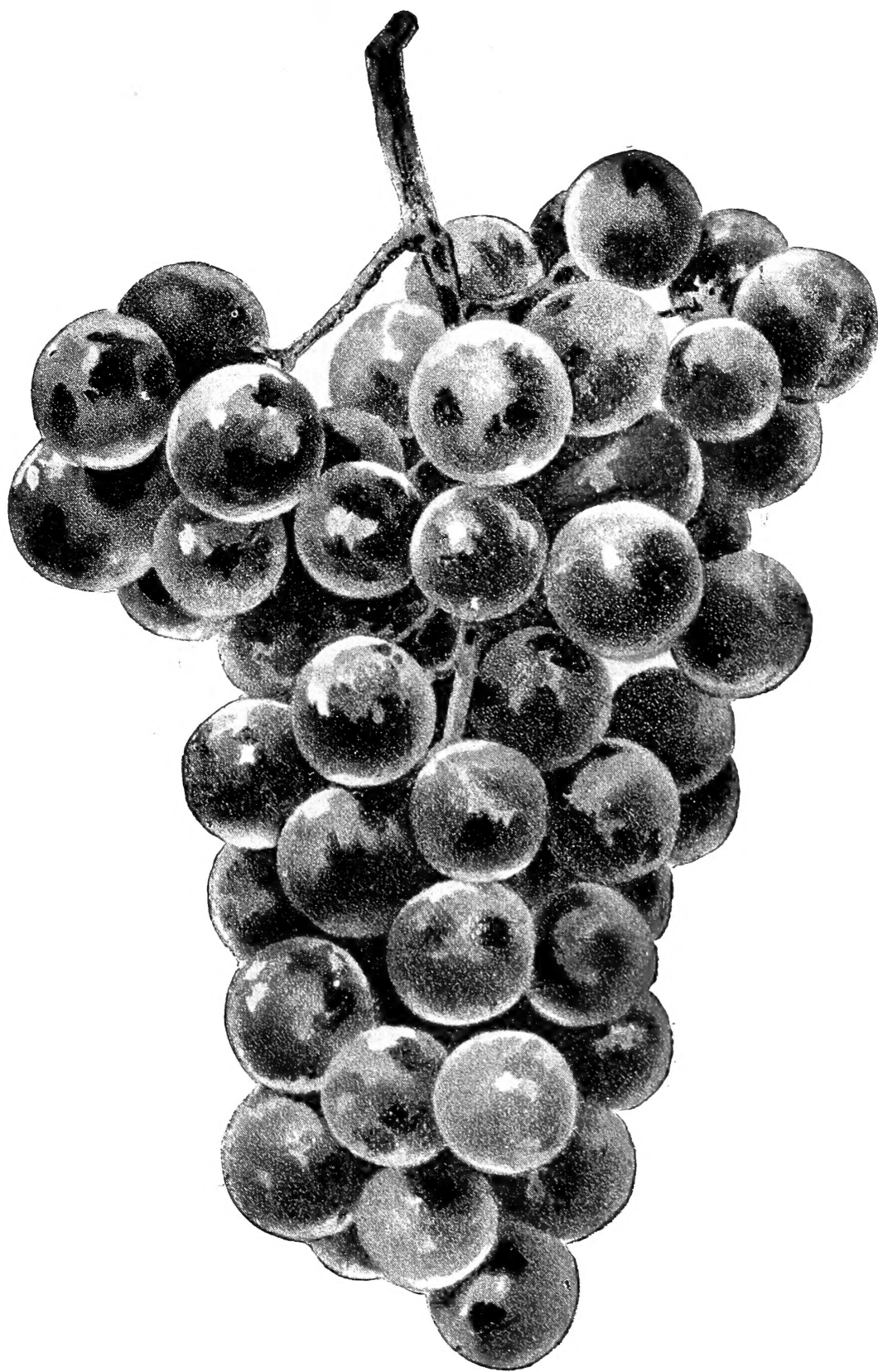
THE NEW AMERICAN GRAPE, THE PIERCE.