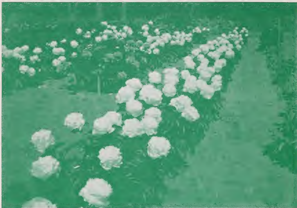
This picture shows the type of growth of the Lin's Peonies

If you do not grow peonies you should. They are about fool proof, need little care and will bloom for many years without replanting.