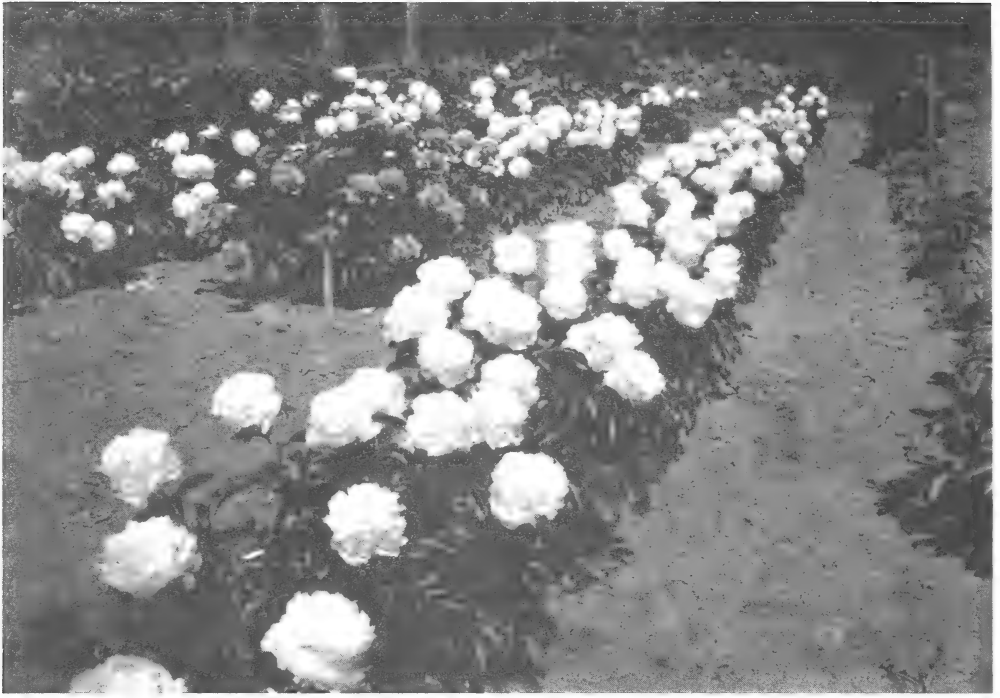
This picture shows the type of growth of the Lin's Peonies

If you do not grow peonies you should. They are about fool proof, need little care and will bloom for many years without replanting.