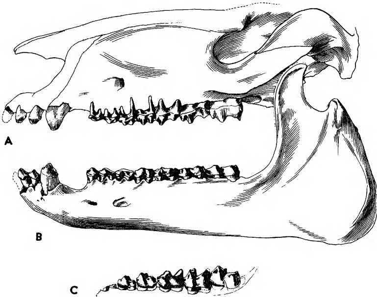
FIG. 1. Pappaceras confluens . A. A.M.N.H. No. 26660, left side of skull. B. A.M.N.H. No. 26660, labial view, left ramus of mandible. C. A.M.N.H. No. 26666, labial view, lower left cheek teeth. All \times \frac{1}{4} .

A.M.N.H. No. 26667 (fig. 2C, 2D), a loose, nearly unworn, left upper premolar, supplies additional characters. This tooth, apparently P^2 , from the ?Irdin Manha, possesses a protoloph that swings around posteriorly to the lingual end of the metaconule, which, however, abuts against it, thus damming the median valley. The gross effect of the transverse lophs is a V pattern, as in the worn third and fourth upper premolars of the type. The tooth was lost subsequent to the description and illustration.