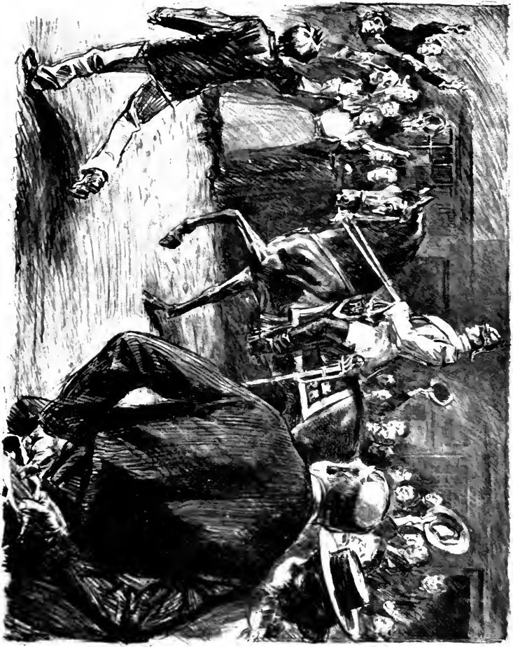
"E HE'S RED, HE'S RIGHT!"—Page 61.