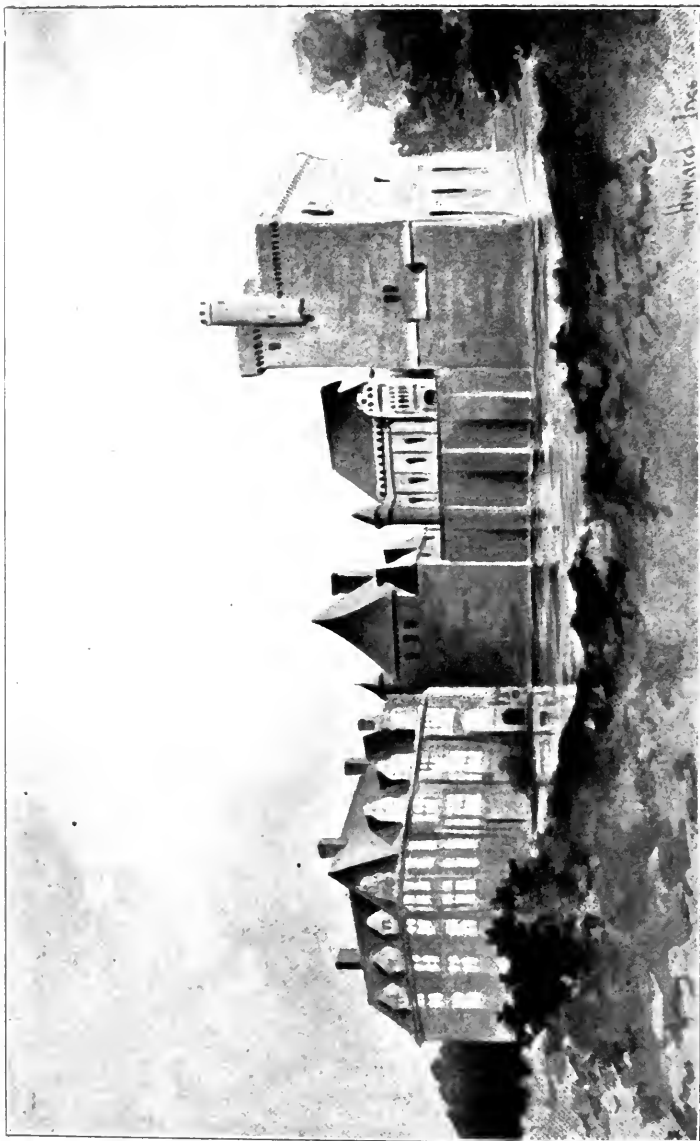
THE CASTLE OF ZENDA.