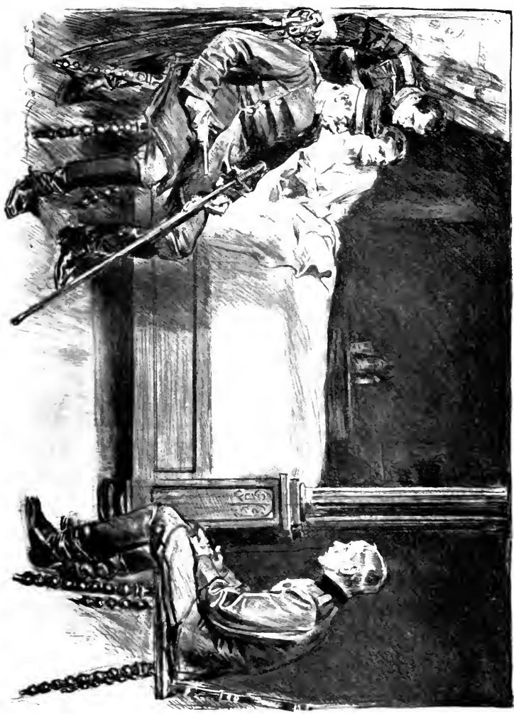
"THE FELLOW'S STORY WAS RUDELY TOLD."—Page 181.