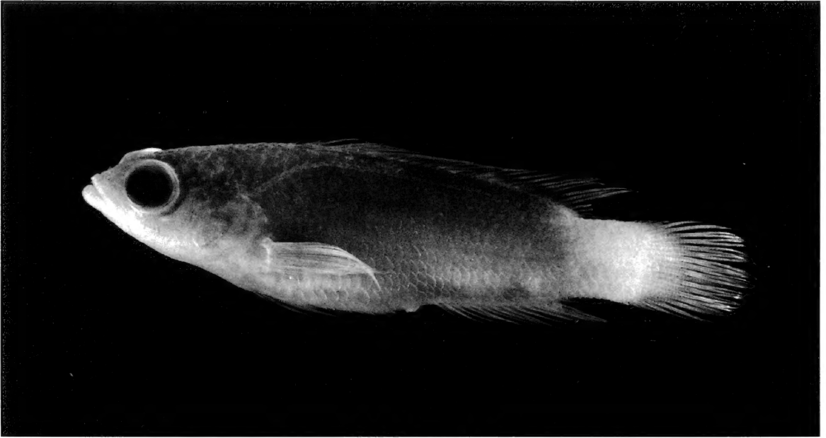
Fig. 1. Holotype of Pseudochromis kolythrus new species, ROM 65061, 37.7 mm SL male, north of Passe de Dumbéa, Récif Mbere, New Caledonia.

Ventral margin of lower lip narrowly interrupted at symphysis; scales on head, nape, anterior part of body including pectoral-fin base, preanal contour, and dorsal contour of body beneath anterior part of dorsal fin cycloid, the remainder ctenoid; dorsal and anal fins without basal scale sheaths, although with a few intermittent small scales overlapping fin bases; predorsal scales extending anteriorly to second anterior interorbital pore; operculum with 6 small, irregular bumps; denticles of outer ceratobranchial-1 gill rakers well developed only on distal halves or tips of rakers; predorsal formula 0/0/0 + 2/1 + 1/1/1/1/1 + 1 ; dorsal-fin spines slender and weakly pungent; preanal formula 1/1 + 1/1/1 + 1/1 ; anal-fin spines slender and weakly pungent, the first spine much less stout than the second; pelvic-fin spine slender and weakly pungent; second segmented pelvic-fin ray longest; caudal fin rounded; vertebrae 10 + 16 ; epipleural ribs 13; epurals 3.