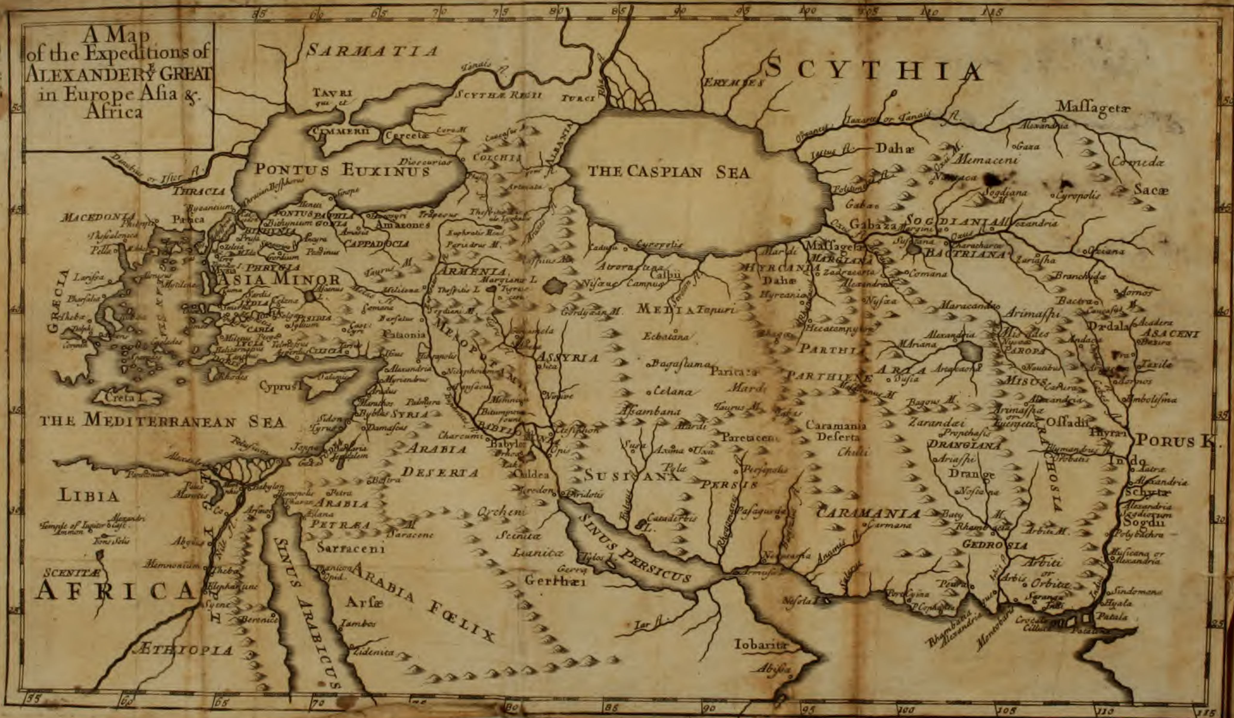
A Map of the Expeditions of ALEXANDER GREAT in Europe Asia & Africa