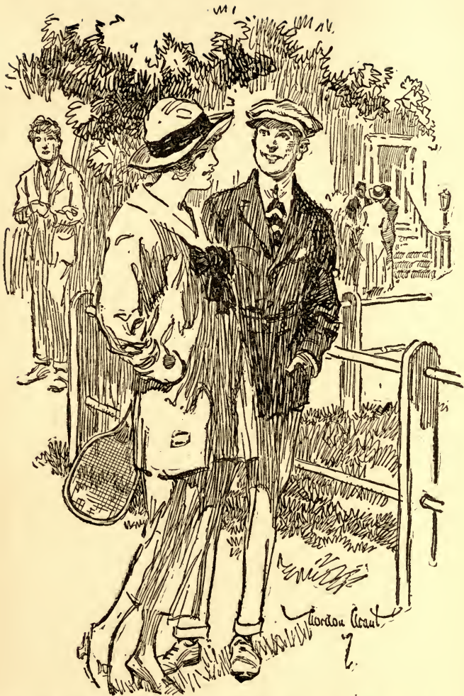
This lightsome sprig was hourly to be seen with some new and pretty skirt