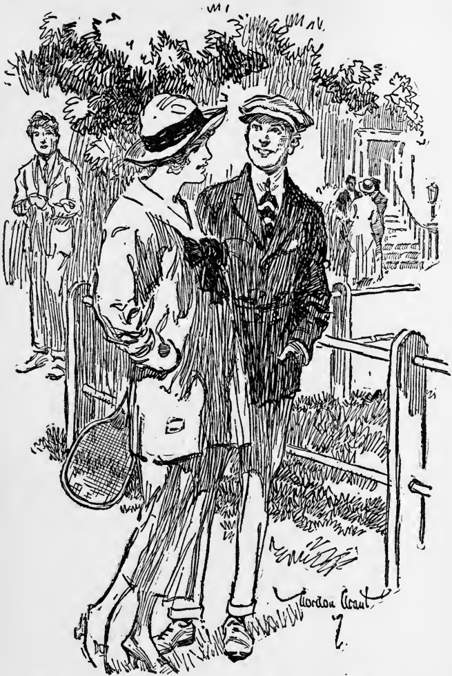
This lightsome sprig was hourly to be seen with some new and pretty skirt