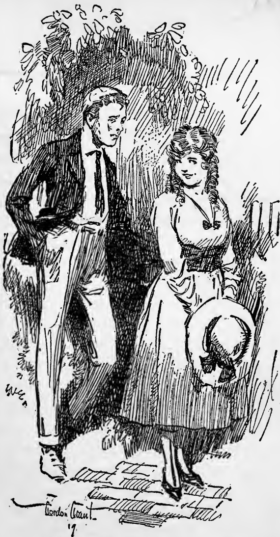
Ramsey sometimes rather supposed they were "engaged"