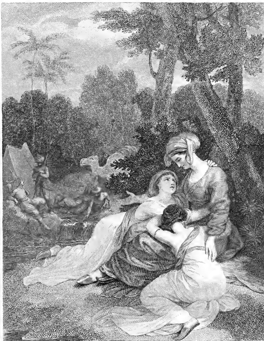
TEKUAH CONSOLING HER ATTENDANTS.