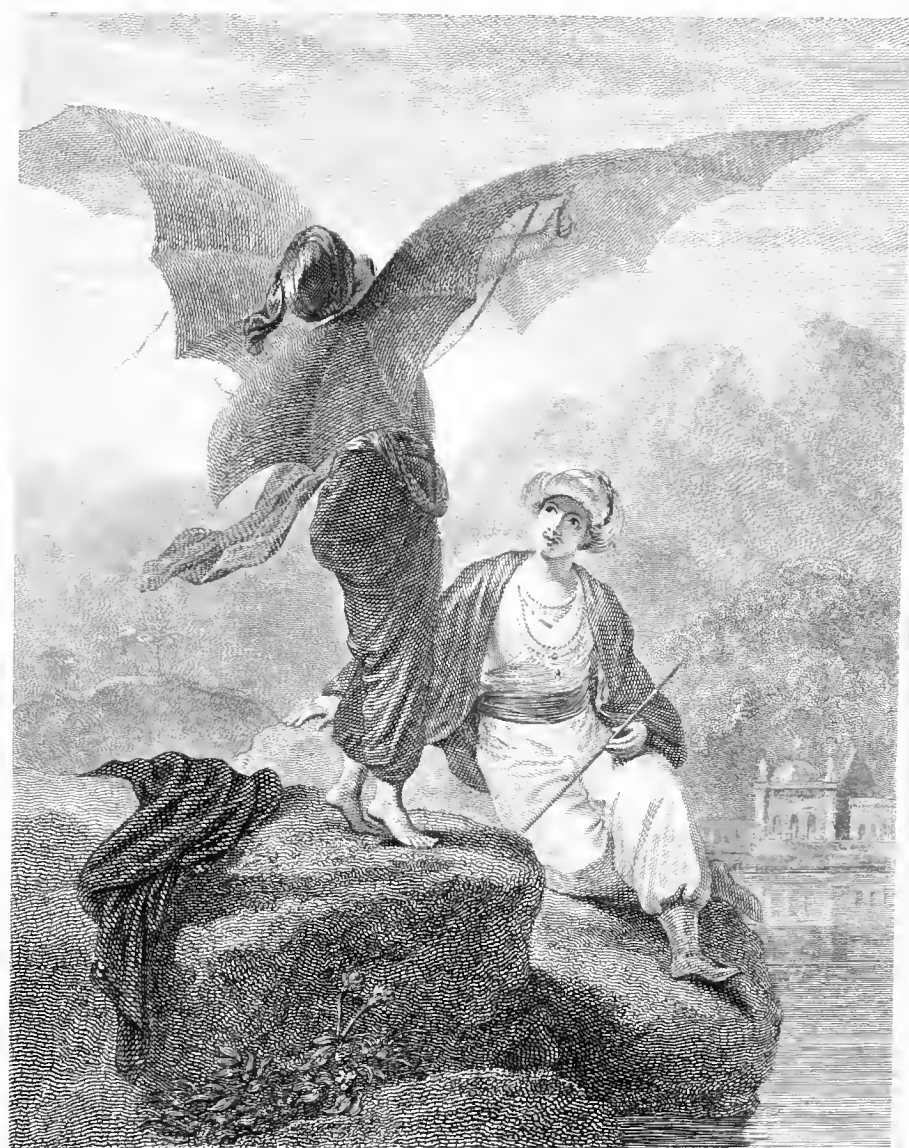
THE ATTEMPT OF THE MECHANIST TO USE HIS WINGS.

PUBLISHED BY WILLIAM MILLER, LONDON, MDCCCX.