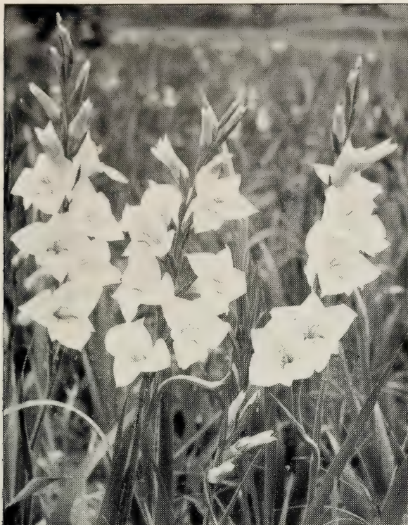
Gladiolus, Princess Sandersoni (See page 26)