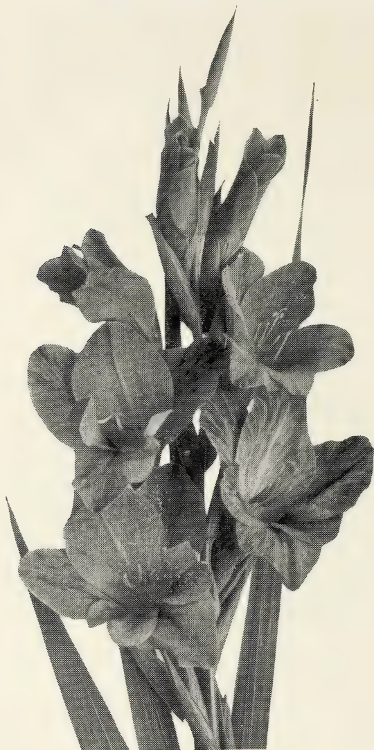
Gladiolus, Mrs. Francis King