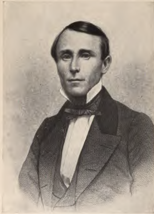
General William Walker.