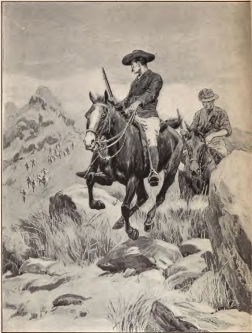
Burnham and Commissioner Armstrong Escaping After Shooting the High-priest Umlimo.