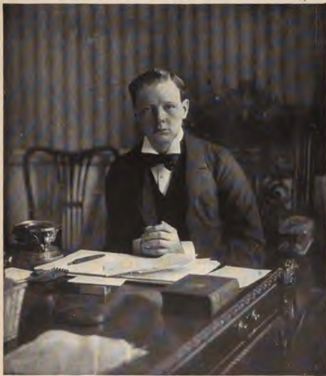
Winston Leonard Spencer Churchill. British Under-Secretary for the Colonies.