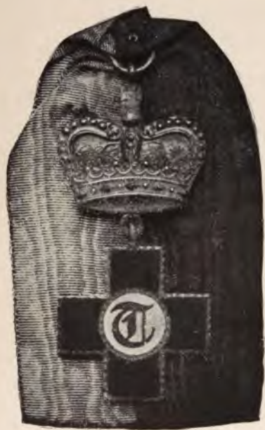
The Order of the Cross of Trinidad.