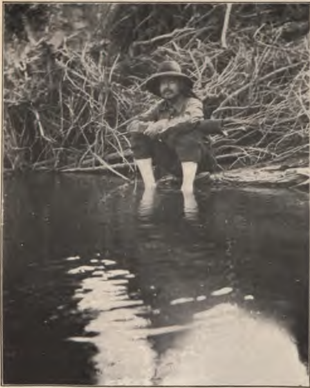
Latest Portrait of Burnham.

Taken this year in Mexico by a member of his expedition along the Yaqui River.