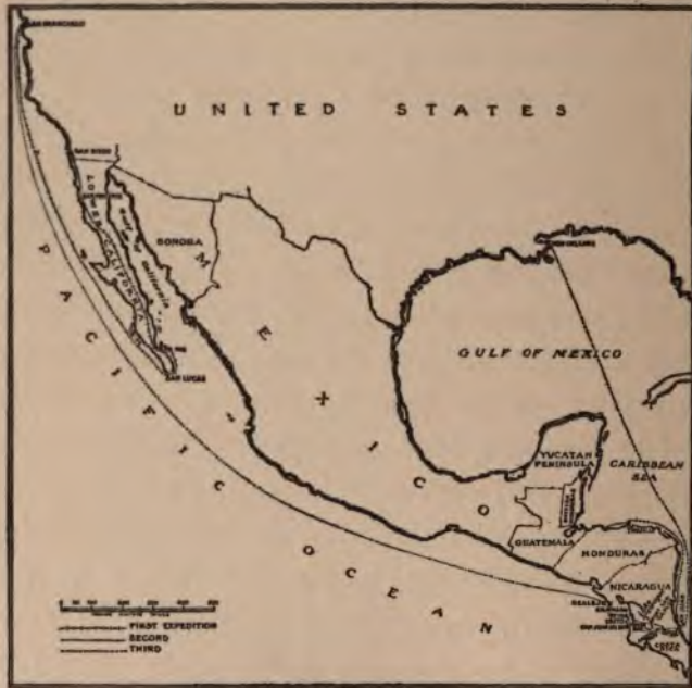
ROUTES OF WALKER'S THREE FILIBUSTERING EXPEDITIONS.

to the country he had conquered, and whose people had honored him with their votes, refused to accept life from the country of his