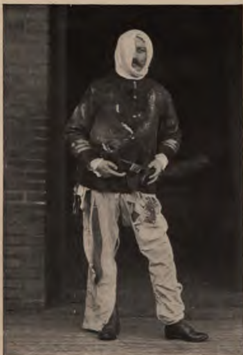
Commander McGiffin in Hospital After the Battle of the Yalu.

Showing damage to clothes due to concussion.