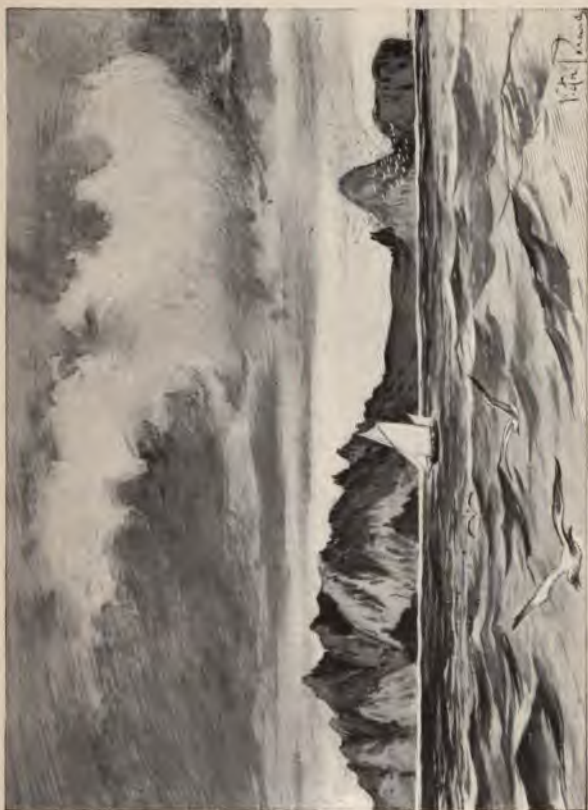
The Island of Trinidad, off the Coast of Brazil.