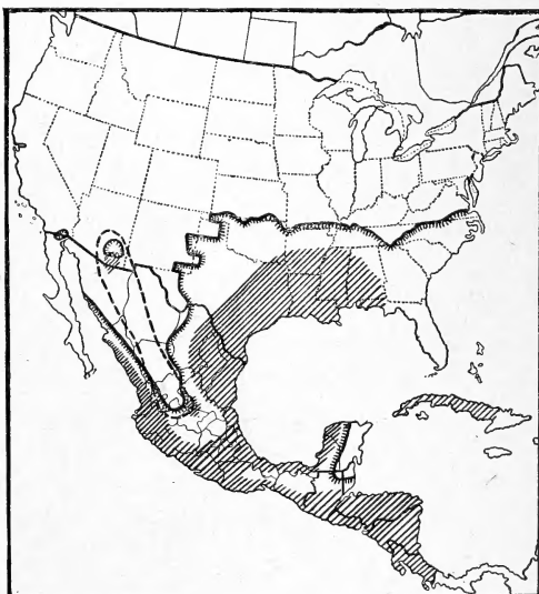
FIG. 1.—Distribution of the Mexican cotton boll weevil. The shading shows the infested area; the heavy lines, the limits of cotton production; the broken line, the probable distribution of the Arizona wild cotton weevil. (Original.)