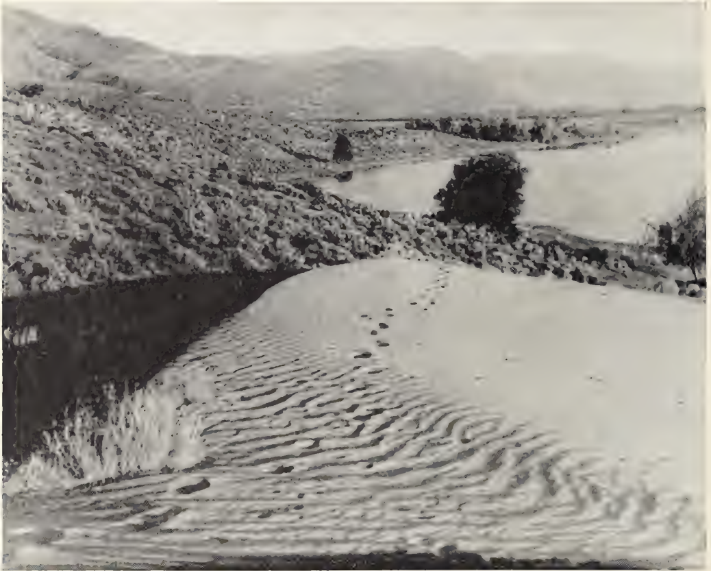
Fig. 1. Osoyoos arid region looking south; camp-site in copse in middle distance; foot of Anarchist Mountain on the left.

Bats were not numerous in the area east of Osoyoos Lake, to which our bat-hunting was confined. One of nine bats observed, when collected, proved to be of this species.