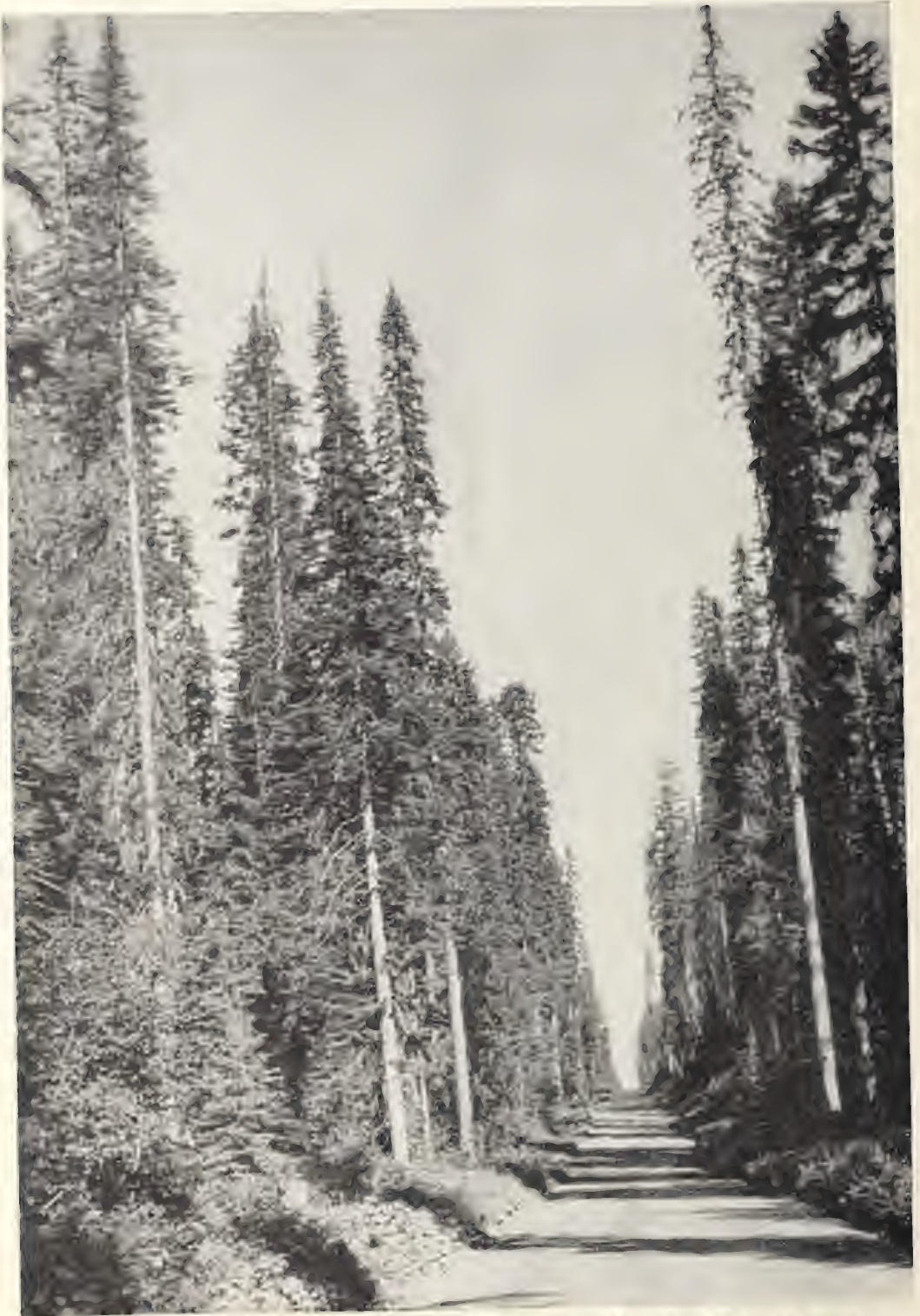
Fig. 1. Looking north-west on the Big Bend Highway near Donald. Engelmann spruce and thimble-berry border the road.