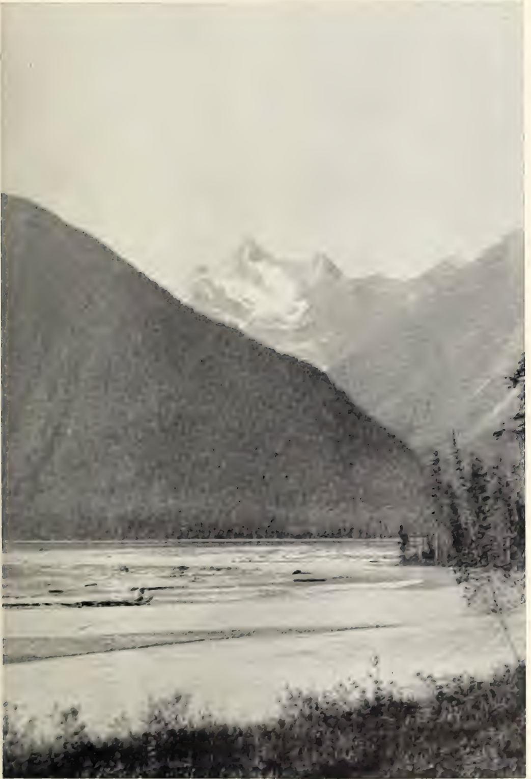
Fig. 3. Mount Trident (10,141 feet), looking south-west from the bridge over Kinbasket River. Junction of river and Kinbasket Lake in foreground.