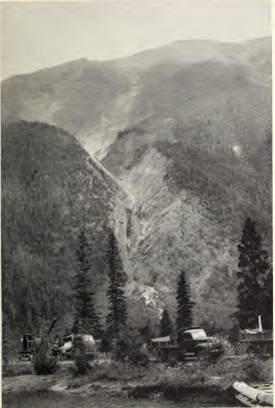
Fig. 2. Kinbasket Mountain (8,100 feet), showing detritus fan at its base. Kinbasket River in the foreground.