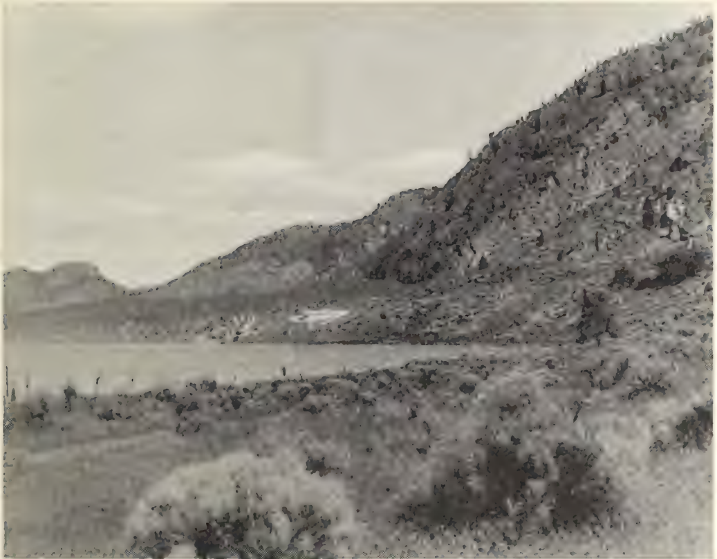
Fig. 2. Osoyoos arid region looking north from camp-site; Osoyoos Lake on the left.

A large adult was observed in the dry forest near the summit of Anarchist Mountain. The animal was travelling by day, down one of the many trails which interlace this area.