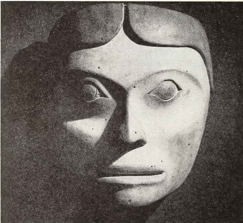
Tsimshian portrait mask. (Newcombe collection.)