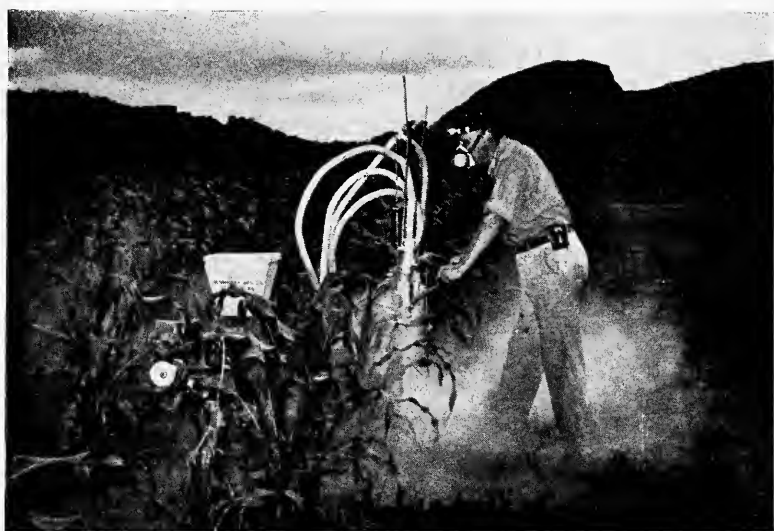
Dusting corn during the evening for control of the borer.