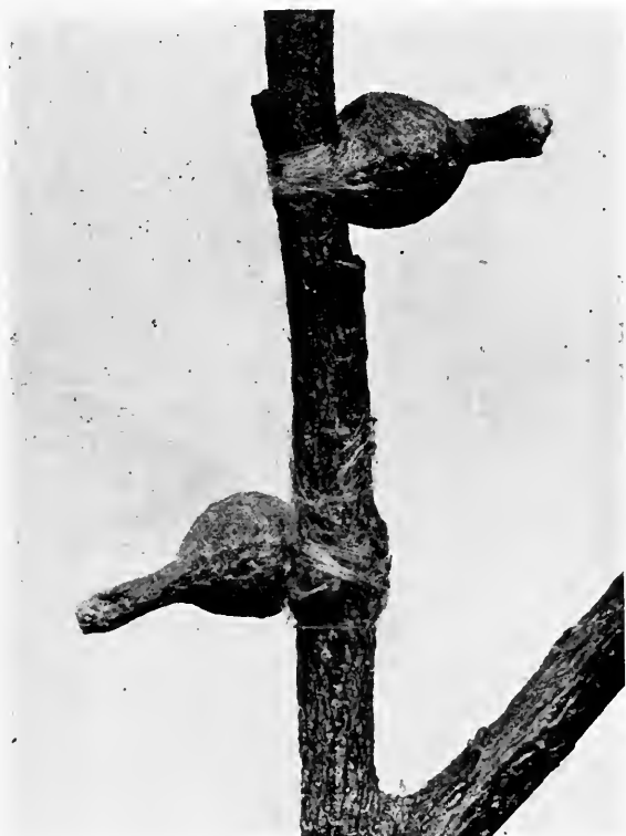
FIGURE 5. Egg cocoons of Mastophora cornigera Hentz, a spider new to New England.