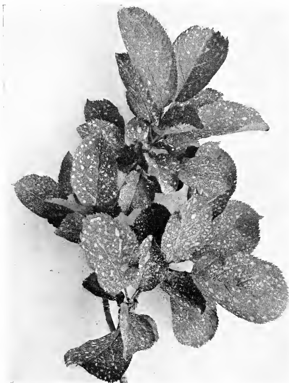
FIGURE 3. Spray residue remaining on apple foliage sprayed with modified dynamite on June 12. Photograph made September 16.

more than that. The situation for the experiment is an extremely difficult one from the standpoint of both curculio and apple maggot control. Table 11 gives the figures obtained from examination of the fruit at harvest, and indicates that the modified formula is fully as good as the straight "dynamite" sticker. The type of cover is different, however, the poison being deposited in spots instead of being continuous (Figure 3). Various growers examined the trees during August and expressed satisfaction with the foliage and fruit.