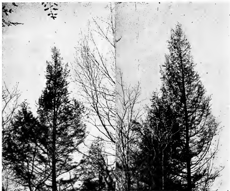
FIGURE 4. Hemlock trees at Branford partially defoliated by Ellopiathasaria Walker in 1940.

however, was not injured. Inasmuch as the survival of these trees was doubtful, the stand was cut in the late fall. At Branford about two acres were involved. The trees were about the same size and the same type of injury, although slightly less pronounced, was observed (Figure 4). The larvae of this species mature in September. It hibernates in the pupal stage, and pupae were abundant in the undecomposed litter under the trees in the winter of 1940-1941. A sample taken at Branford yielded 35 to 50 per square yard close to the bases of the trees.