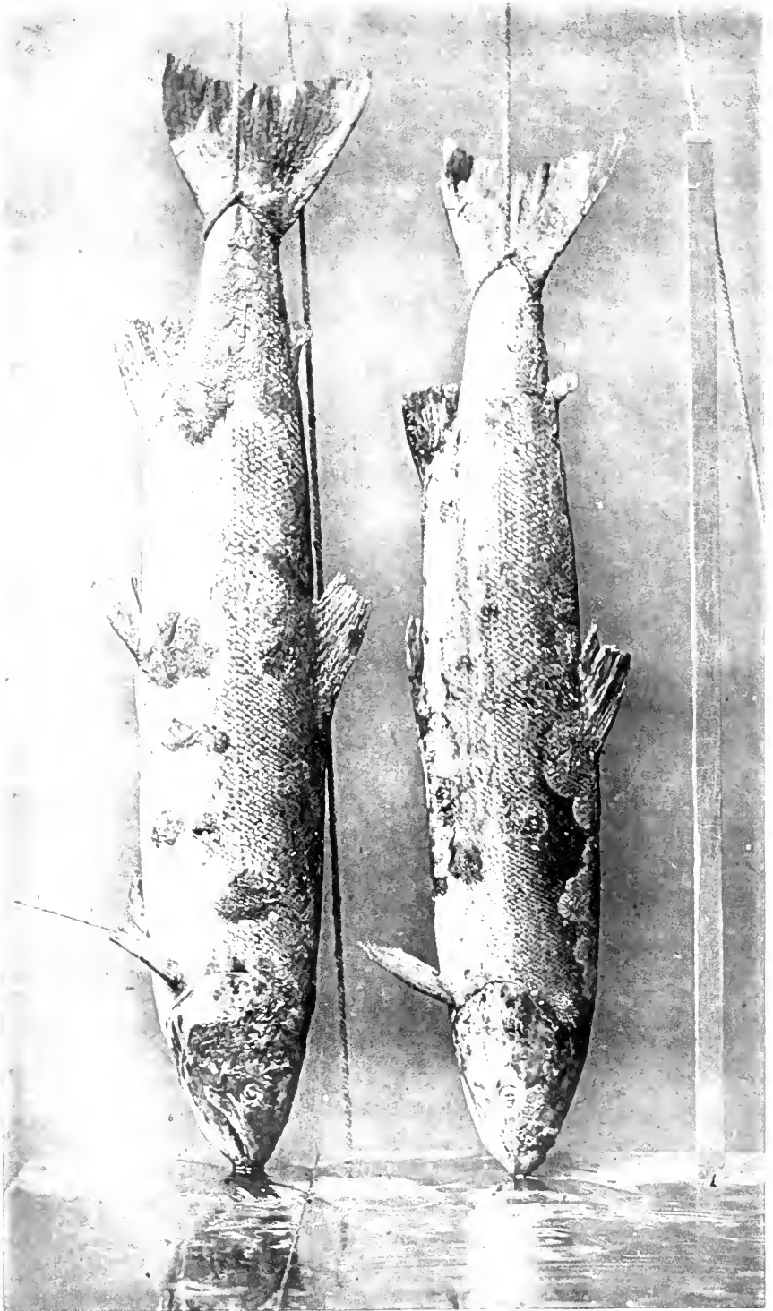
PHOTOGRAPH OF DISEASED SALMON.