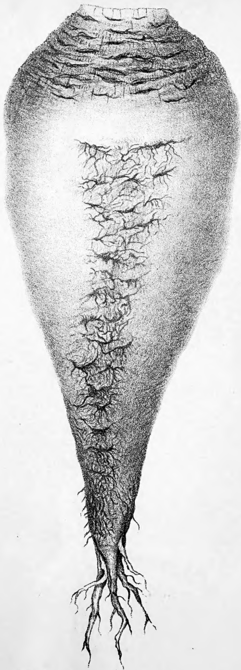
BEST SILESIAN SUGAR BÉET.