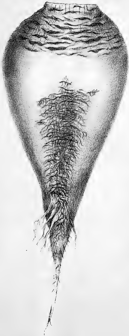
FRENCH VILMORIN SUGAR BEET