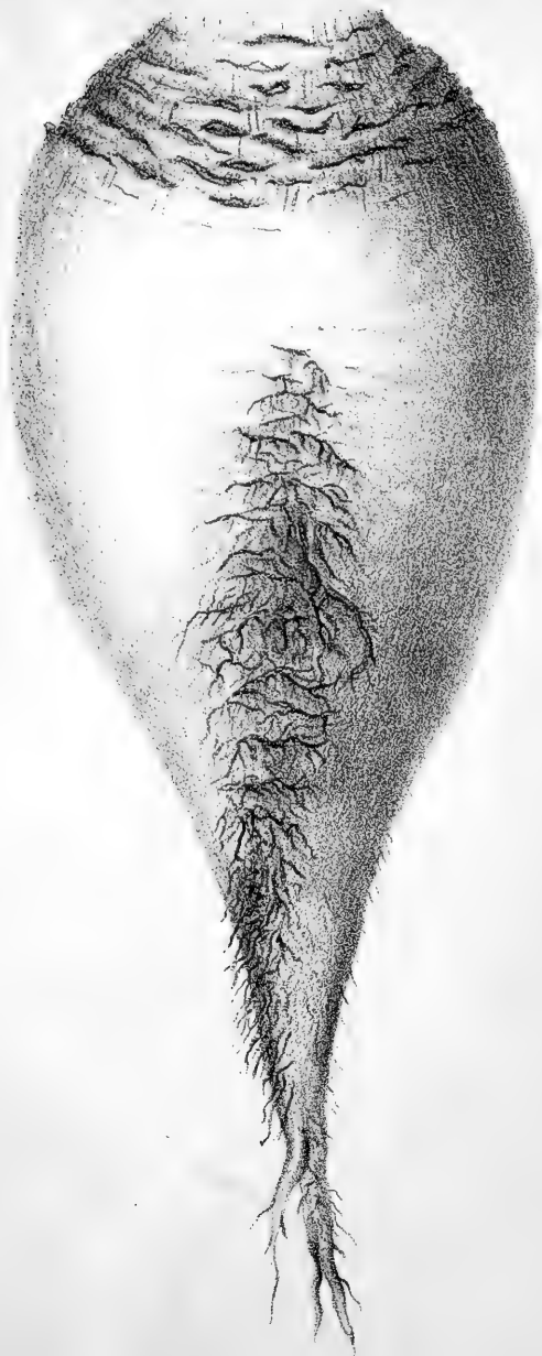
FRENCH VILMORIN SUGAR BEET