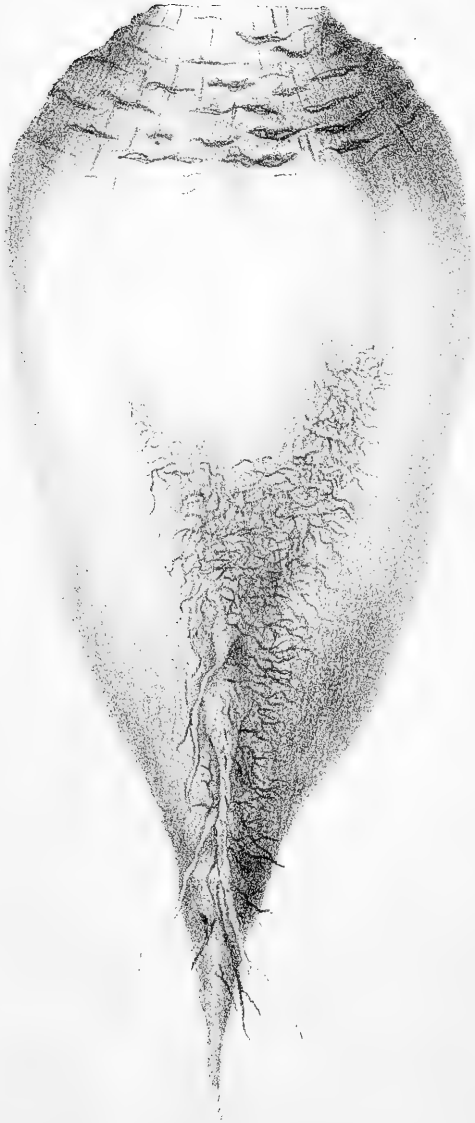
WHITE IMPERIAL SUGAR BEET.