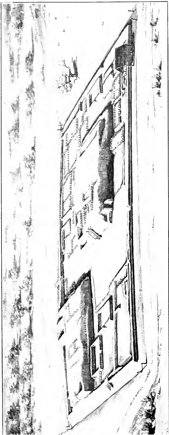
CASA GRANDE, COMPOUND B.