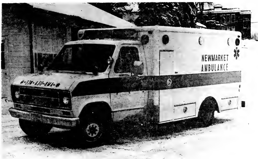
New 1976 Ford Classic Modulance Vehicle