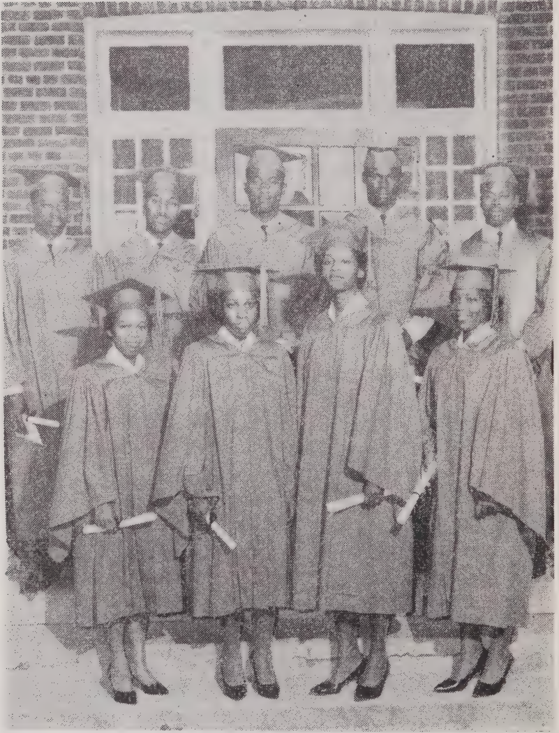
High School Graduates—1963