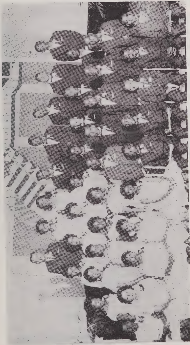
Angier B. Duke Elementary School Graduates