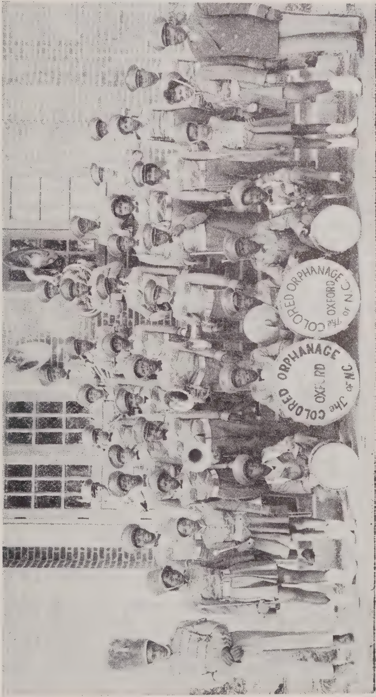
ALL READY FOR A PARADE