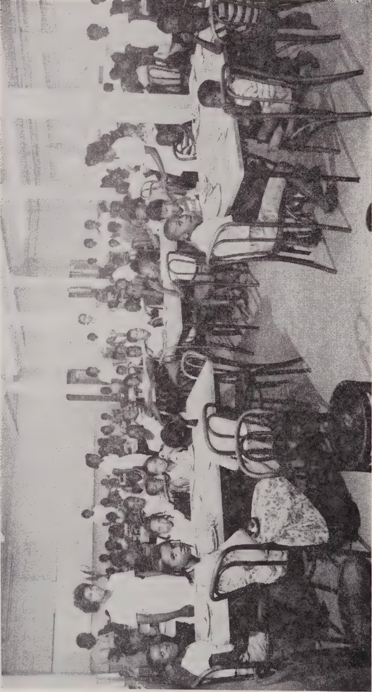
MEAL TIME IN DINING ROOM