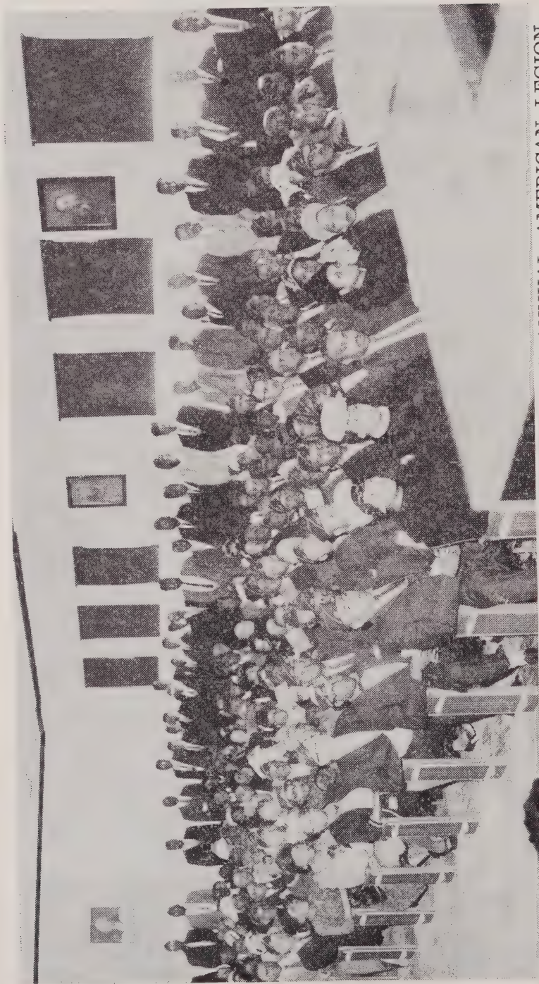
A PARTIAL VIEW OF STATE WIDE AUDIENCE ATTENDING ANNUAL AMERICAN LEGION PILGRIMAGE TO ORPH ANAGE (OCTOBER 1963)