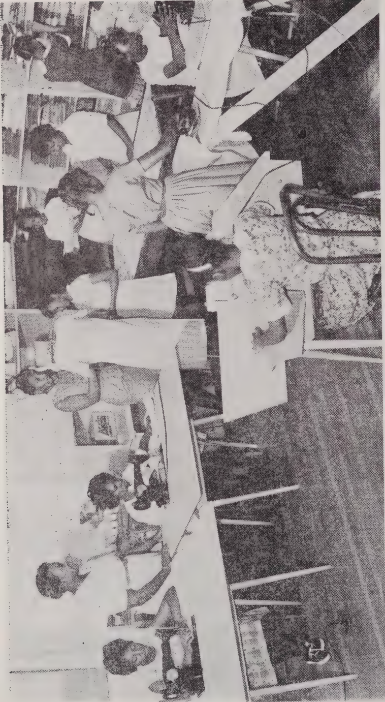
A CLASS IN SEWING