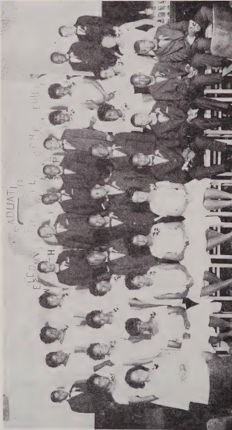
1964 ELEMENTARY SCHOOL GRADUATES