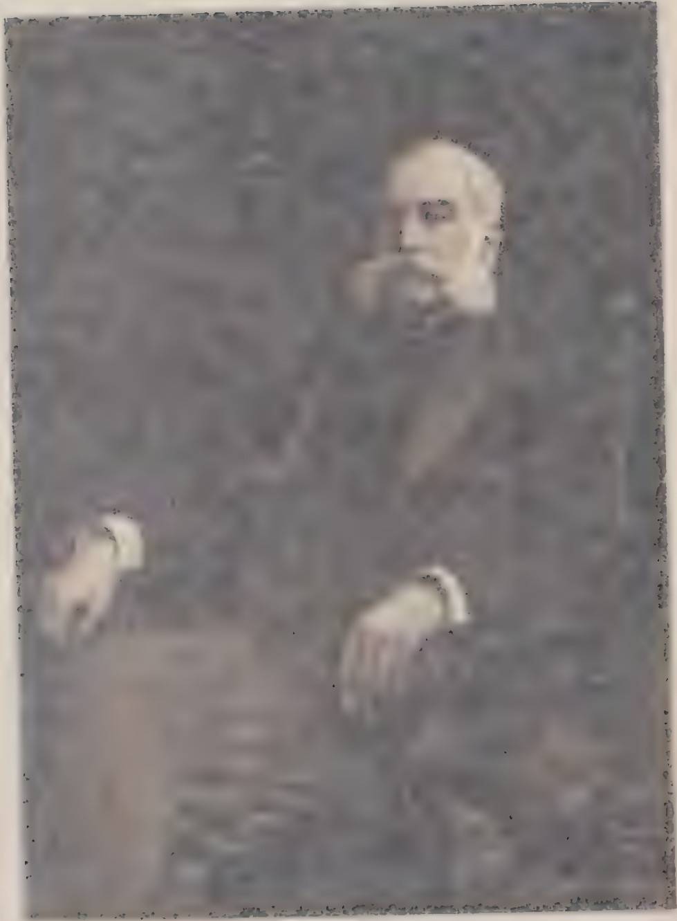
MORRIS KETCHUM JESUP