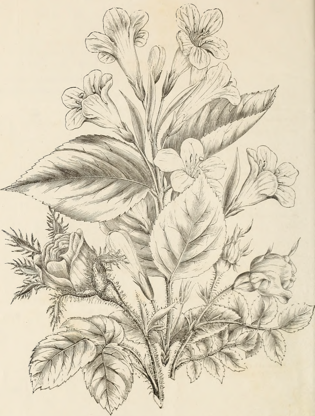
WEIGELIA ROSEA AND ROSEBUDS.