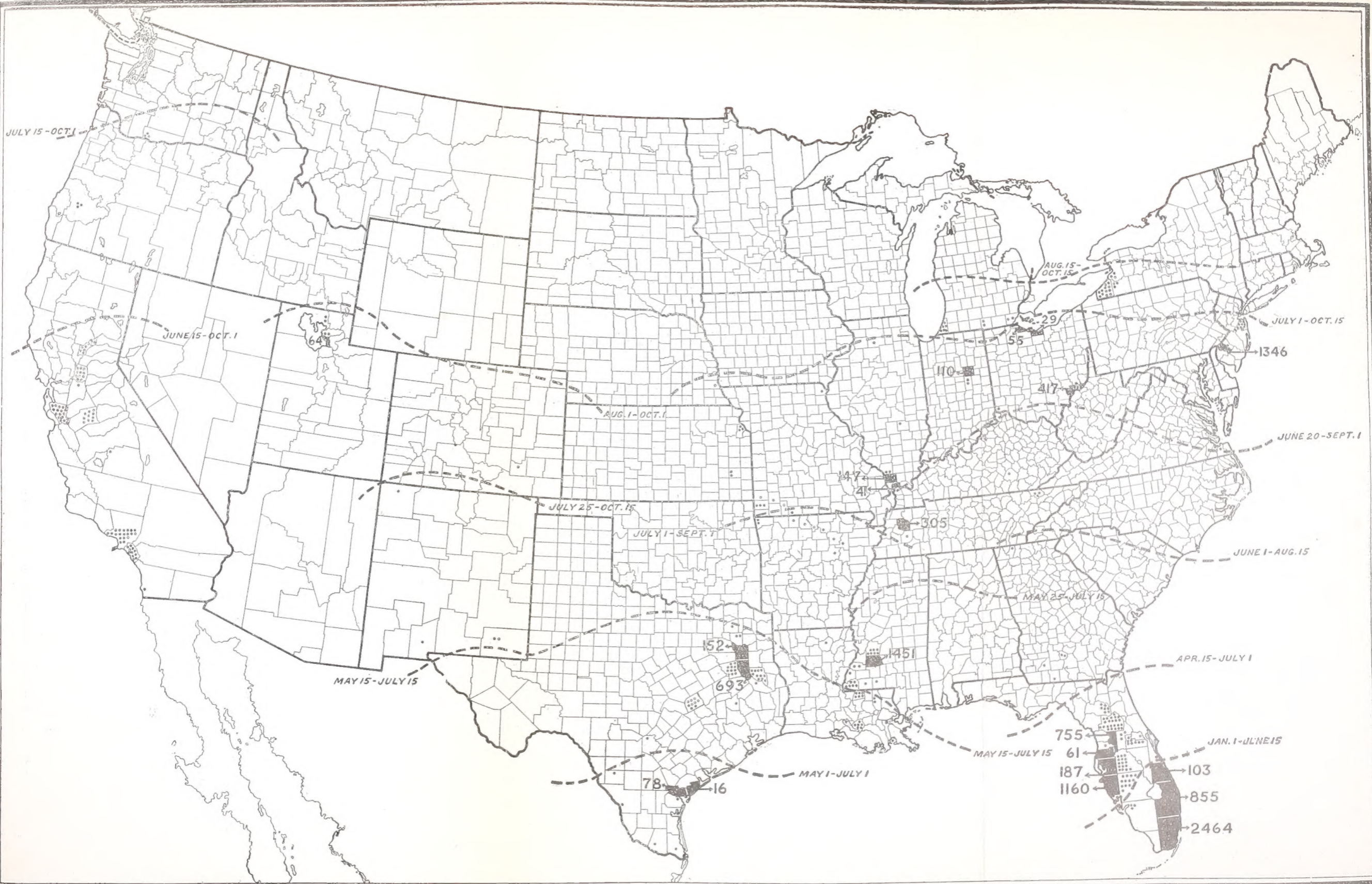
FIG. 1.—Map showing tomato shipments during the year 1914. Each dot represents 5 carloads (or fraction thereof). Black areas represent number of carloads indicated by figures.