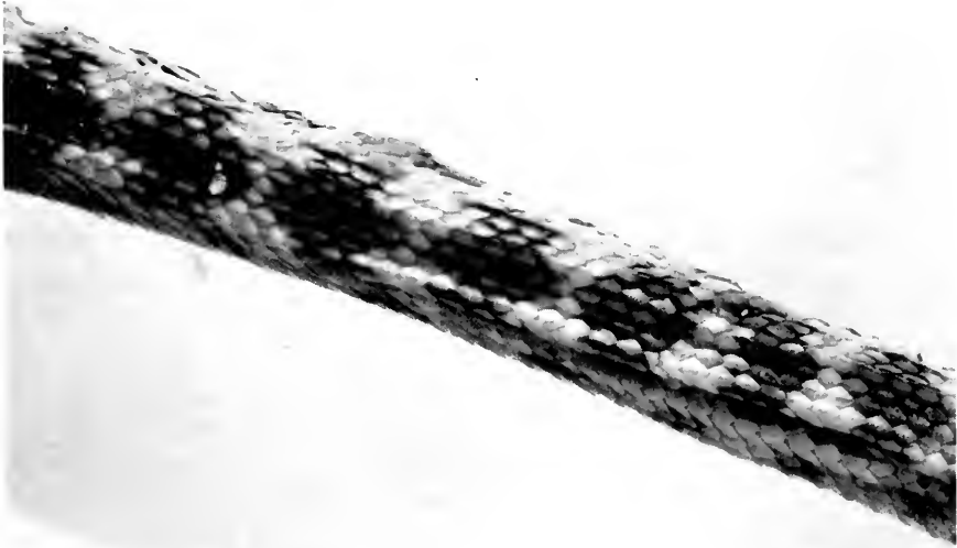
FIG. 58. Dorsal color pattern of Spalerosophis diadema cliffordi ; CNHM 82671.

With the acquisition of a large series of cliffordi from Egypt, collected by the United States Naval Medical Research Unit No. 3, at