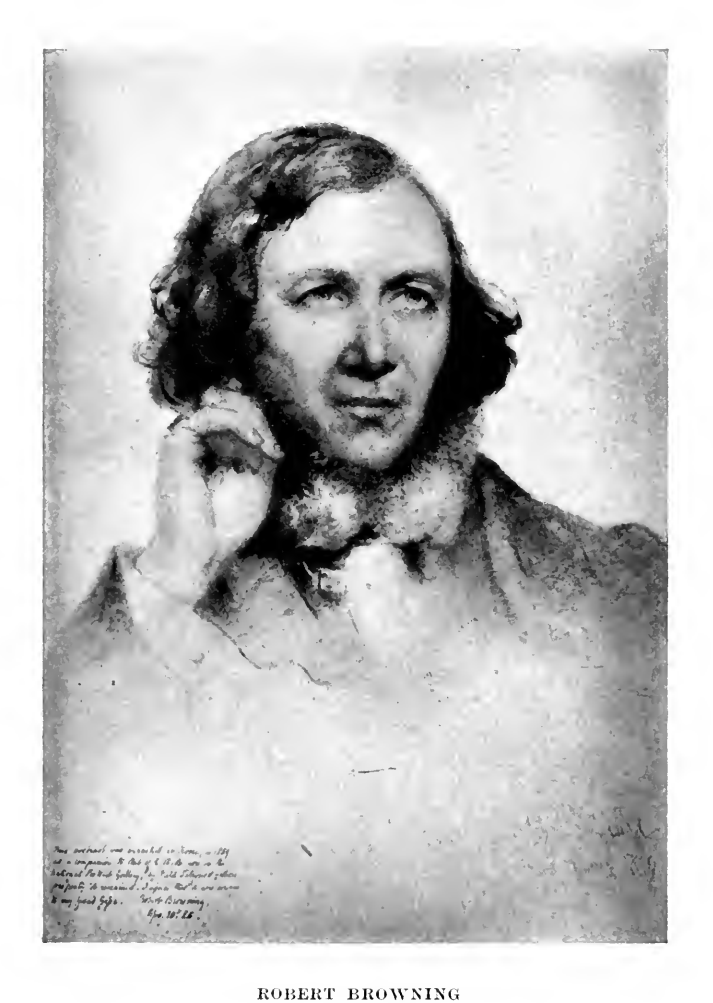
Drawn at Rome in 1859 by Field Talfourd