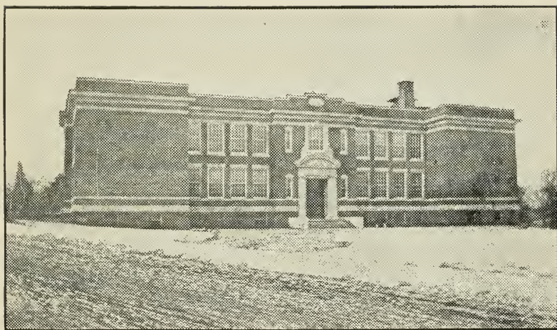
THE VOSE SCHOOLHOUSE.