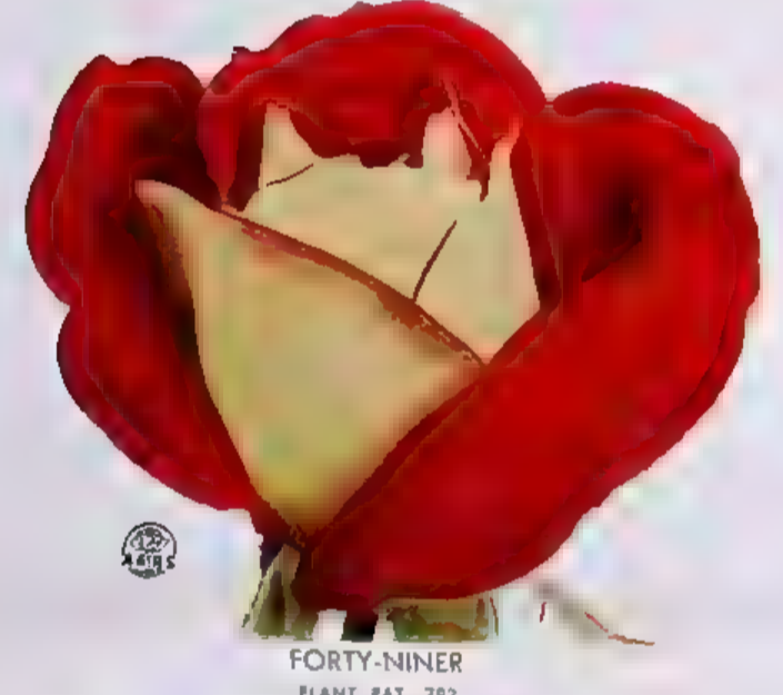
FORTY-NINER PLANT PAT 792 $2.25 each; 3 for $6.00