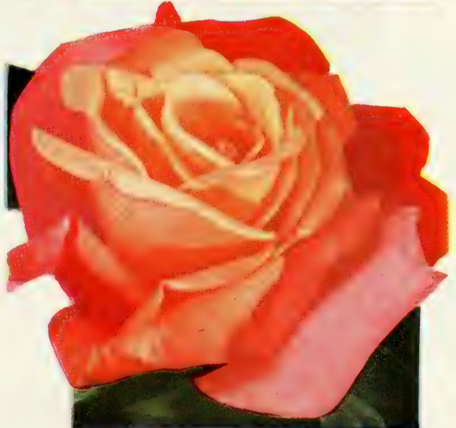
PRES. HERBERT HOOVER—$1.10 each; 3 for $2.85