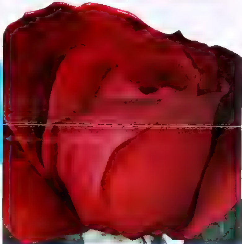
AMI QUINARD—$1.10 each, 3 for $2.85