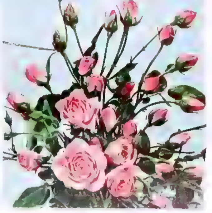
PINOCCHIO PLANT PAT 812 $1.75 each; 3 for $4.65