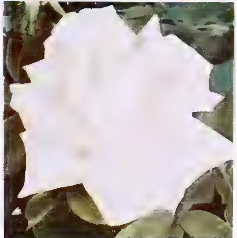
FRAU KARL DRUSCHKI—$1.10 each, 3 for $2.85