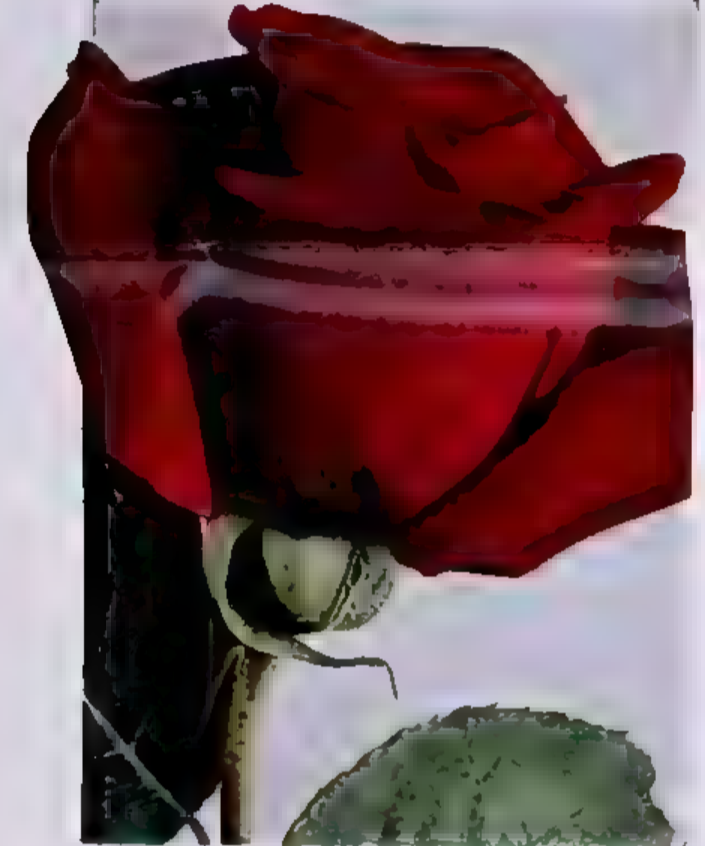
HEART'S DESIRE PLANT PAT 501 $1.75 each; 3 for $4.65