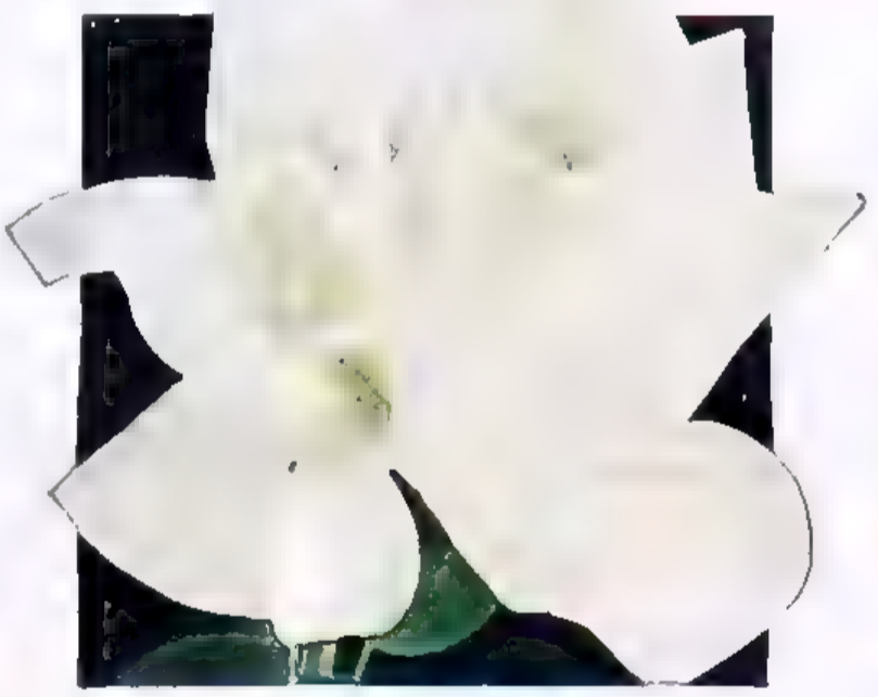
REX ANDERSON PLANT PAT 551 $1.75 each; 3 for $4.65