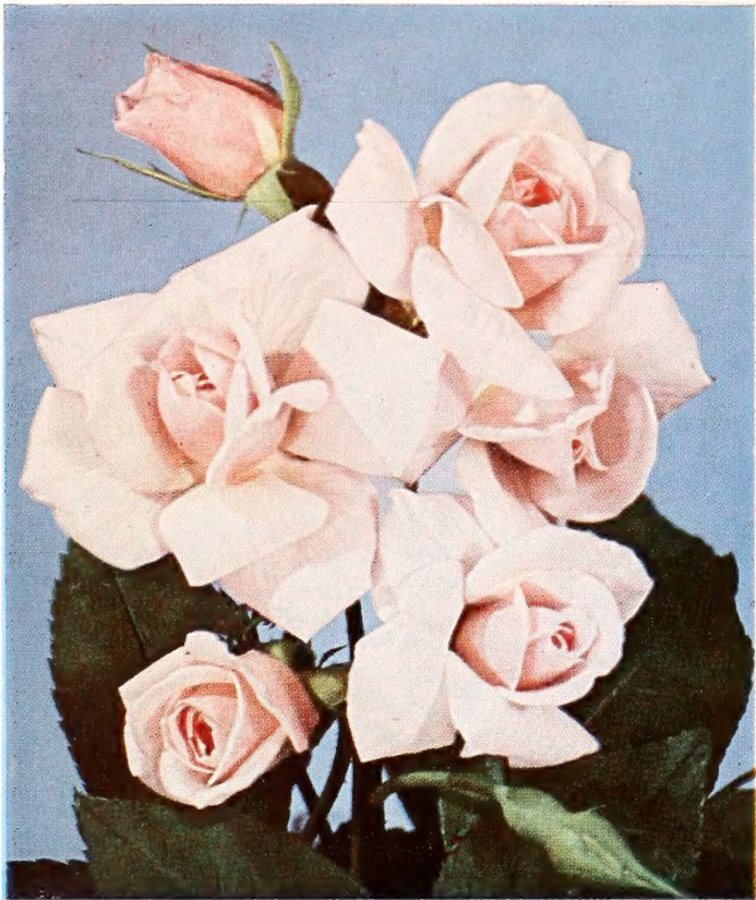
CECILE BRUNNER. The True Sweetheart Rose. Long, pointed bud; flower small, double, fragrant, bright to shell pink. Blooms profusely in clusters from May through August. Give this one two or three years to establish itself and then sit back and collect the compliments. Truly a "thing of beauty"! For more blooms, do not prune severely; simply remove the dead wood seasonally. $1.50 each; 3 for $3.75; 6 for $6.75.

The Miniature Buds of Katharina Zeimet and Cecile Brunner Make the Perfect Corsage for your "Junior Miss".