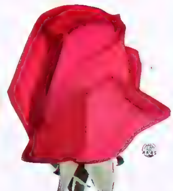
RUBAIYAT PLANT PAT 758 $1.75 each; 3 for $4.65