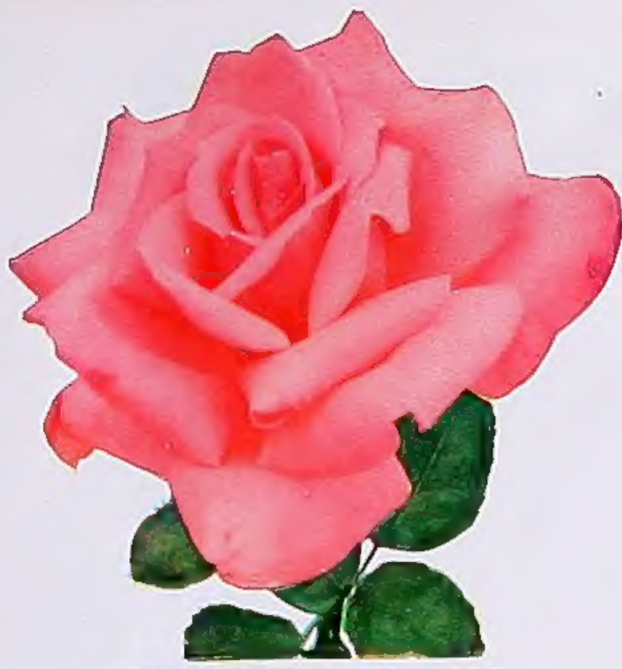
STERLING—$1.25 each; 3 for $3.15