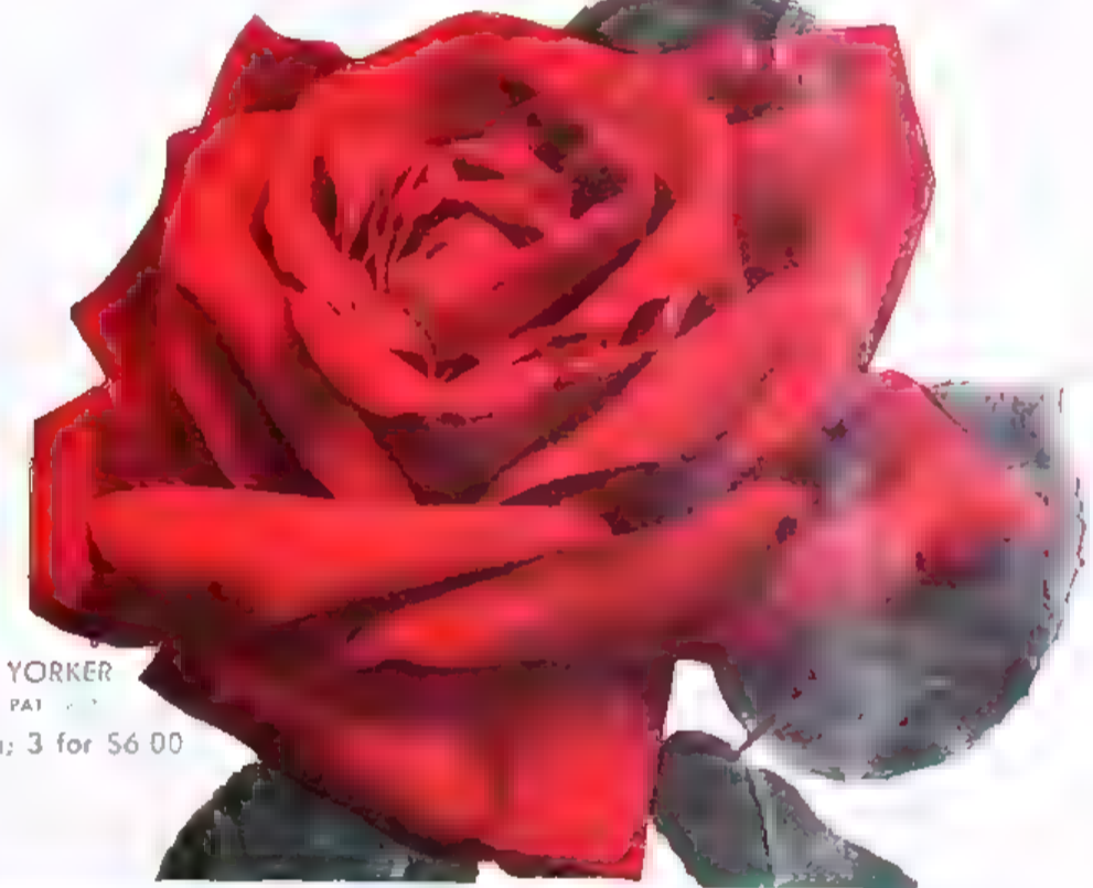
NEW YORKER PLANT PAT 823 $2.25 each; 3 for $6.00