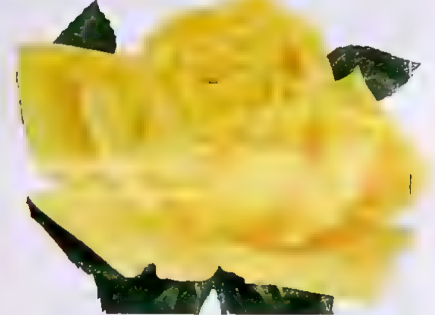
BUCCANEER PLANT PAT 1119 $2.50 each; 3 for $6.60