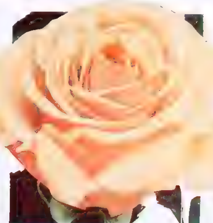
DIAMOND JUBILEE PLANT PAT 824 $2.00 each; 3 for $5.25