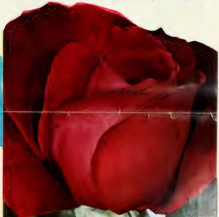
AMI QUINARD—$1.10 each; 3 for $2.85