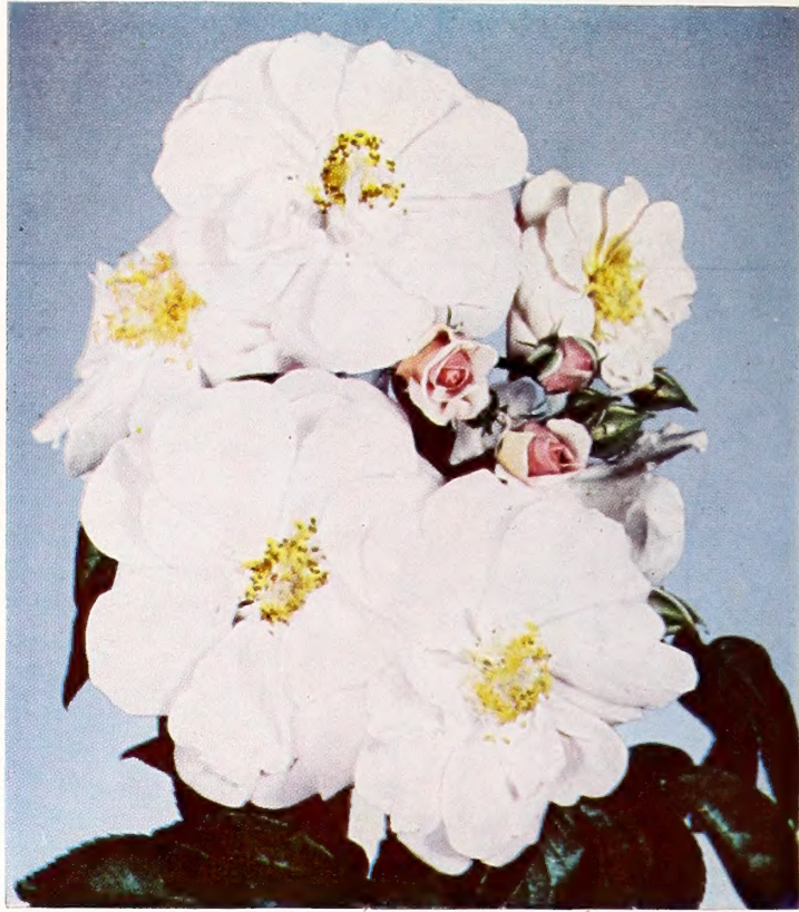
KATHARINA ZEIMET (White Baby Rambler). A small, double, fragrant, pure white polyantha blooming in perfect, hybrid-tea like, baby rose clusters of 25-50 on a short stem. The bush is dwarf and bushy. Made to order for mass plantings and ideal for cutting. $1.25 each; 3 for $3.15; 6 for $6.