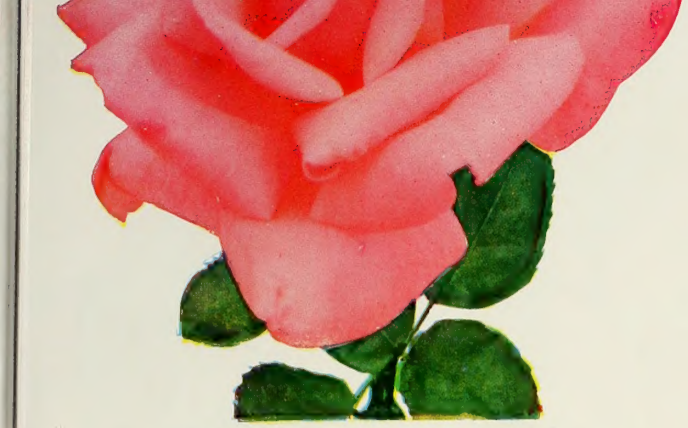
STERLING—$1.25 each; 3 for $3.15