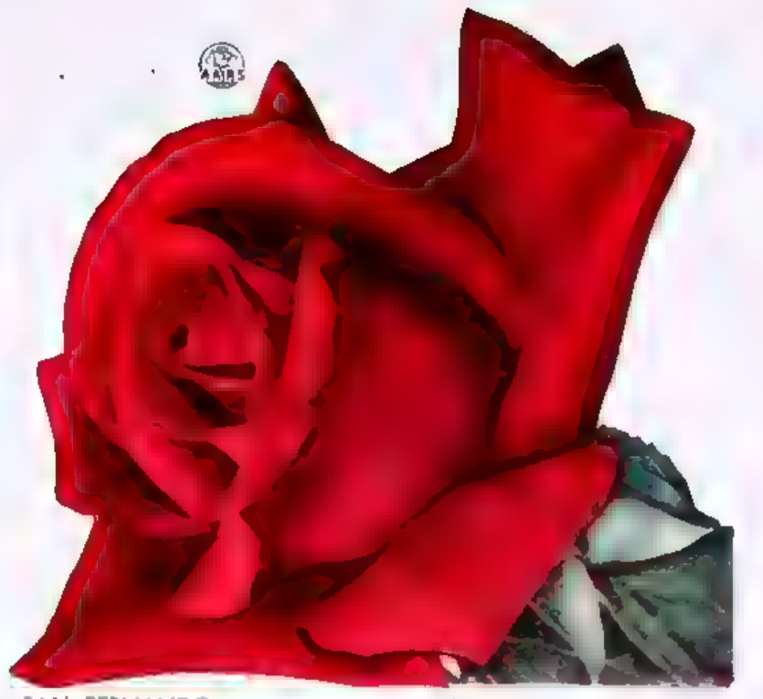
SAN FERNANDO PLANT PAT 785 $1.75 each; 3 for $4.65