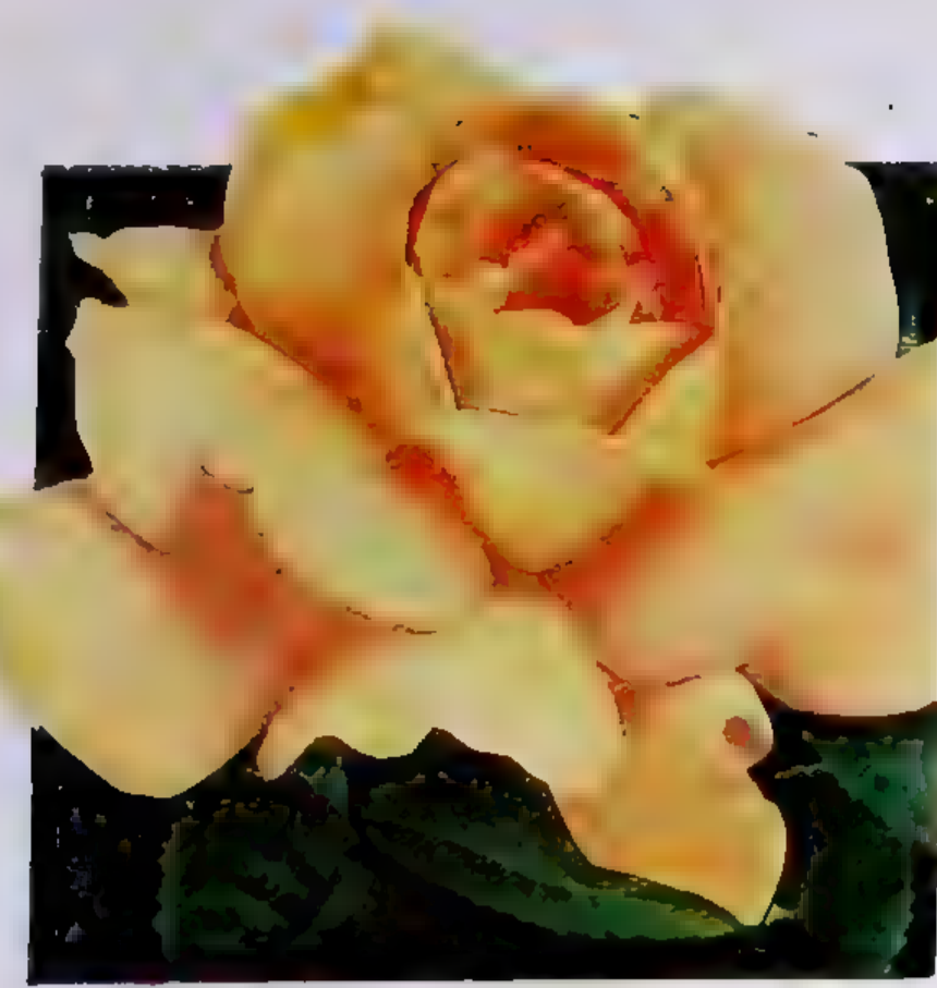
McGREY'S SUNSET PLANT PAT 317 $1.75 each; 3 for $4.65