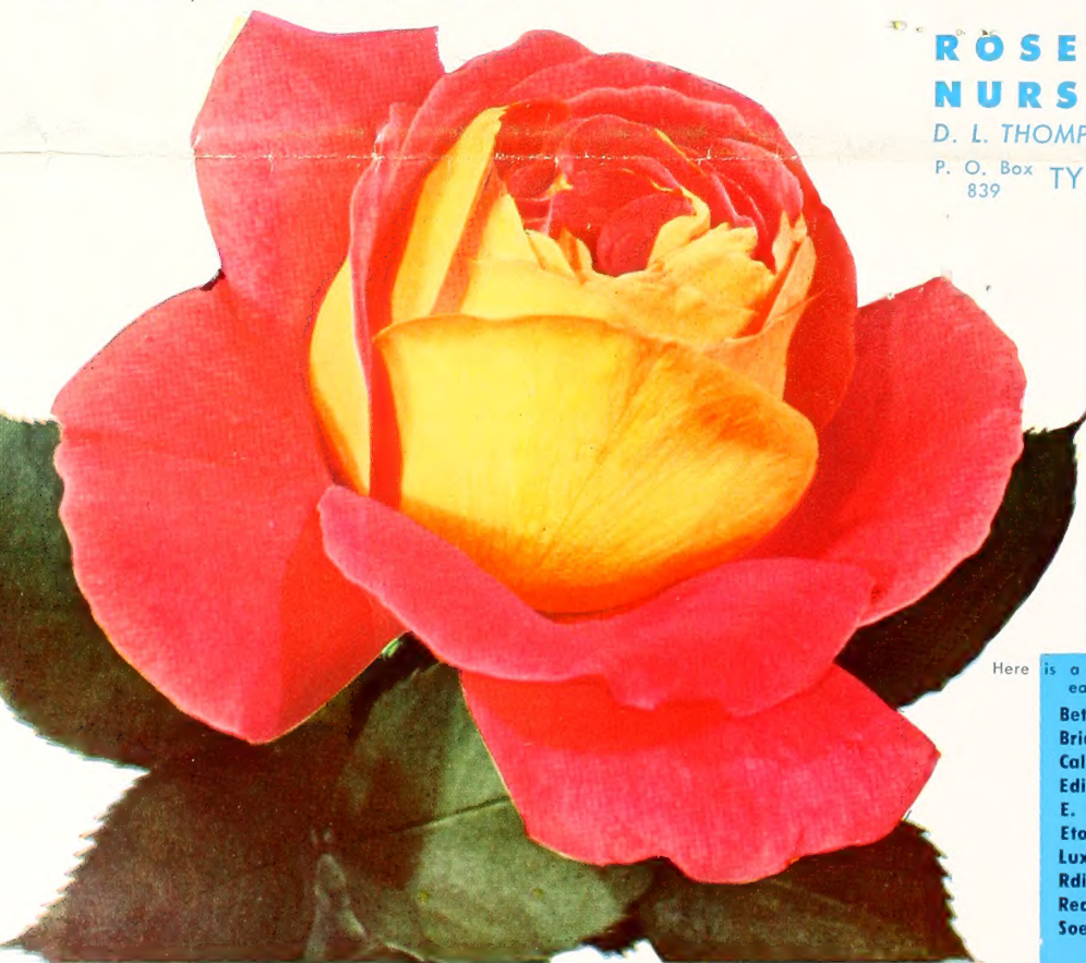
CONDESA de SASTAGO —$1.10 each; 3 for $2.85