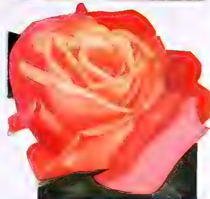
PRES. HERBERT HOOVER—$1.10 each, 3 for $2.85