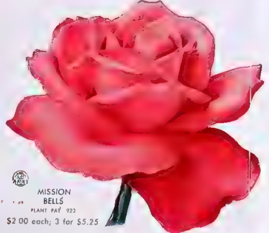
MISSION BELLS PLANT PAT 923 $2.00 each; 3 for $5.25