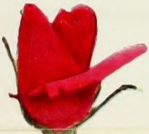
OGUE PAT. 926 ; 3 for $5.25