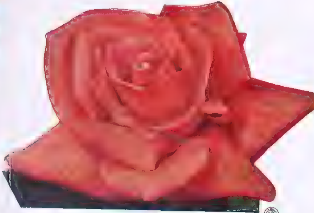
MOJAVE PLANT PAT 1176 $2.75 each; 3 for $7.20