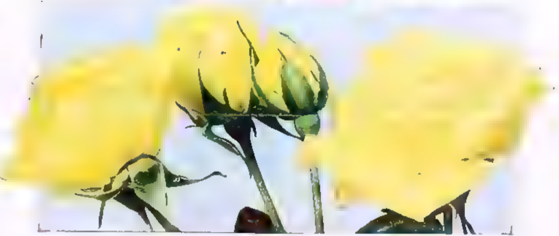
GOLDILOCKS PLANT PAT 672 $1.75 each; 3 for $4.65