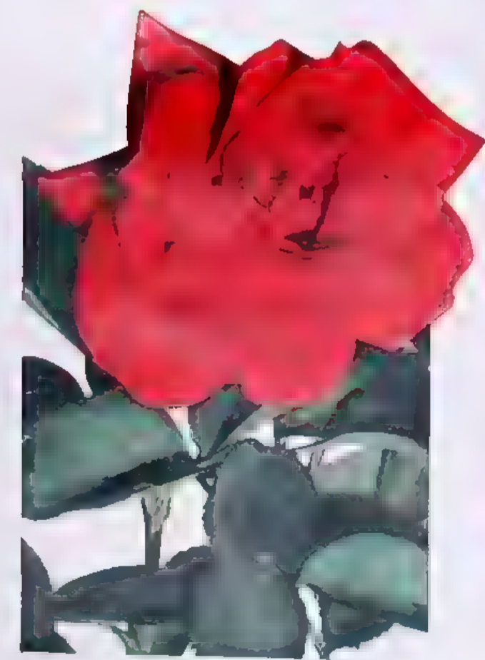
CARROUSEL PLANT PAT 1066 $2.00 each; 3 for $5.25