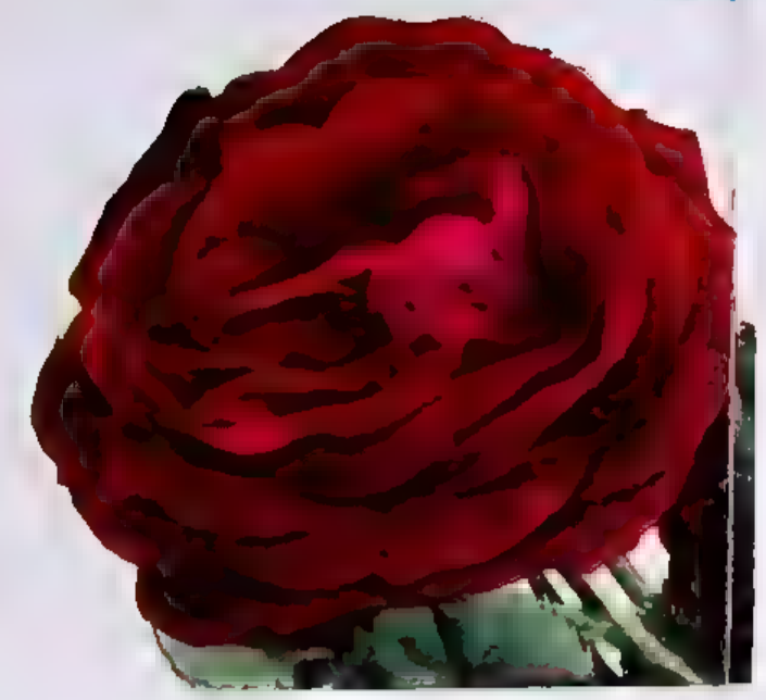
RED PINOCCHIO PLANT PAT 812 $1.75 each; 3 for $4.65