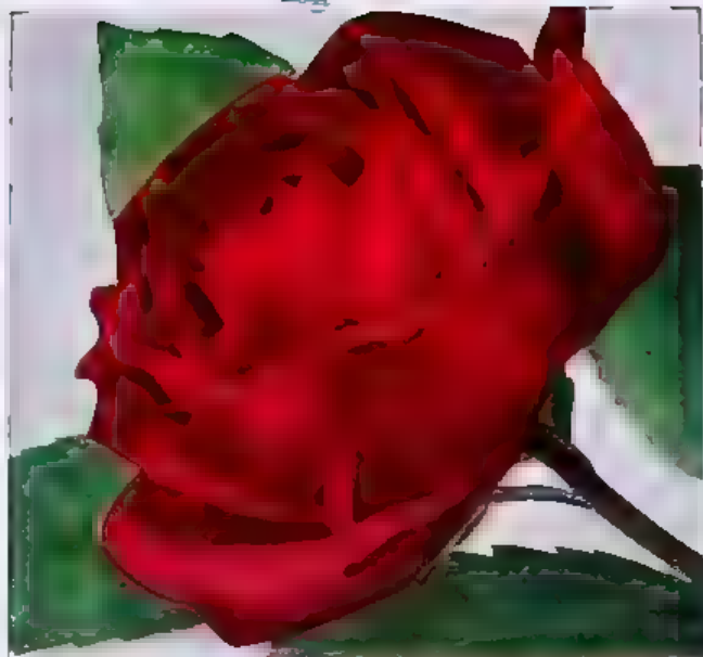
E. G. HILL—$1.10 each, 3 for $2.85