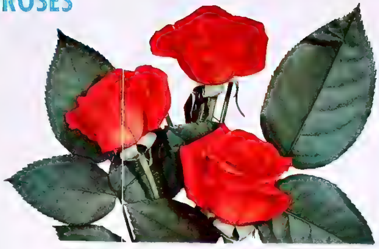
JIMINY CRICKET PLANT PAT 1346 $2.00 each; 3 for $5.25 Vigorous Upright, Very Double