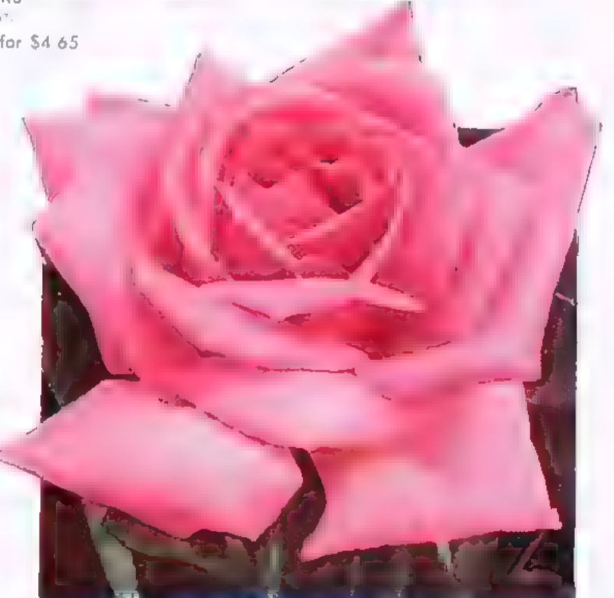
MARY MARGARET MCBRIDE PLANT PAT 537 $1.75 each; 3 for $4.65