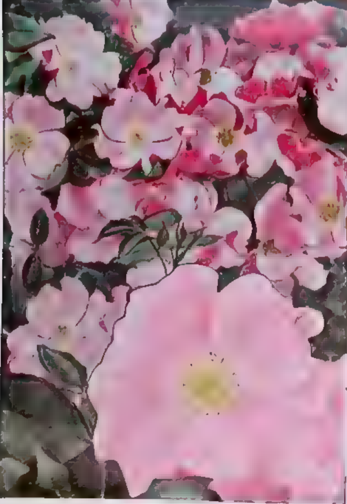
BETTY PRIOR PLANT PAT 340 $1.75 each; 3 for $4.65