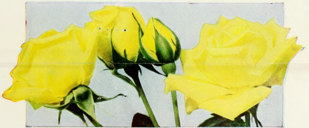
GOLDILOCKS PLANT PAT. 672