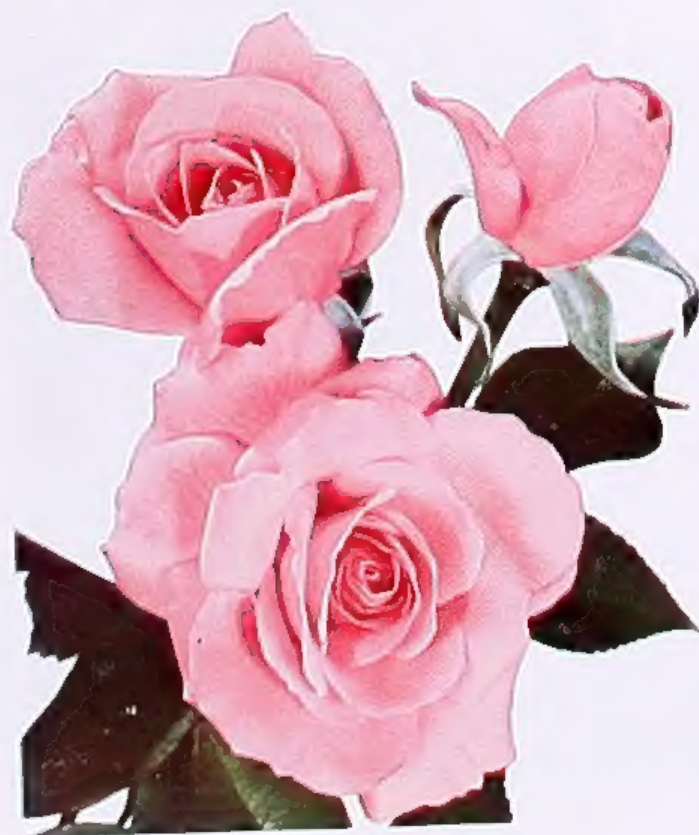
ROSENELFE (Rose Elfe) $1.25 each; 3 for $3.15

Rosenelfe (Rose Elfe). Tiny, La-France pink hybrid tea-like blooms of lasting beauty cluster on long strong stem. Very vigorous. Excellent for cutting. $1.25 each; 3 for $3.15 (See picture)