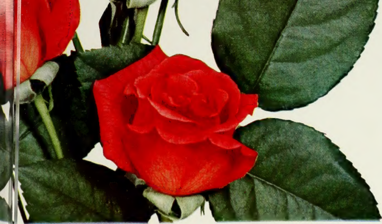
JIMINY CRICKET PLANT PAT. 1346