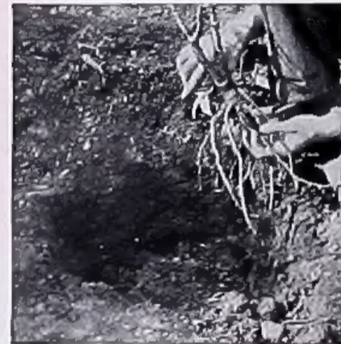
Root Pruning Before Planting