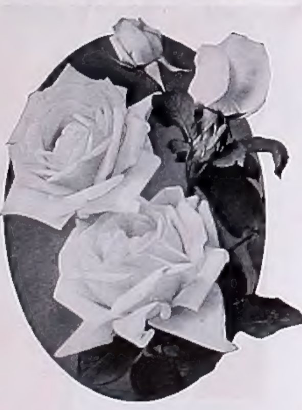
A Border of Floribunda Roses