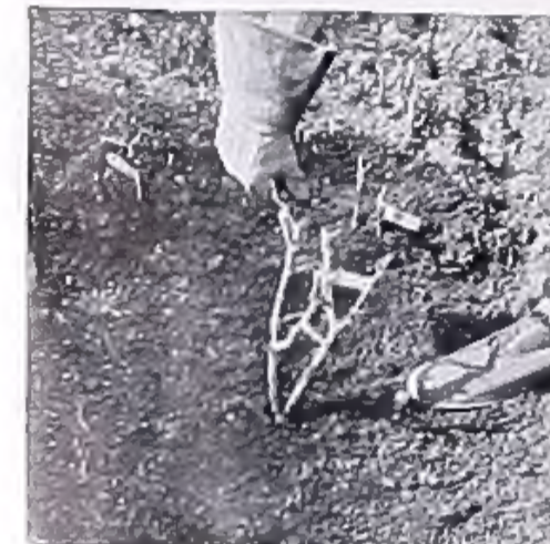
Top Pruning After Planting