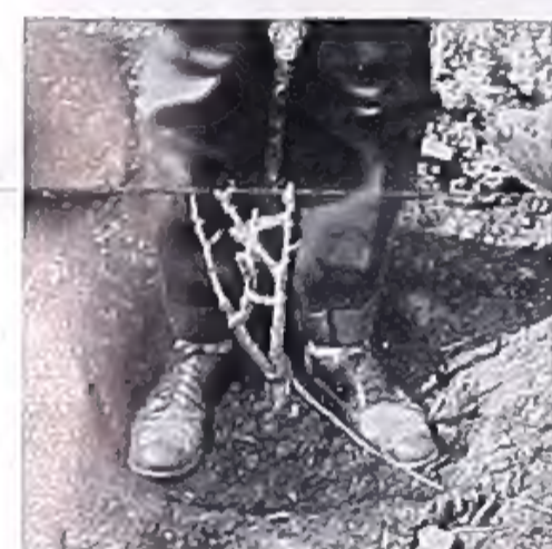
Treading after the Roots are Covered