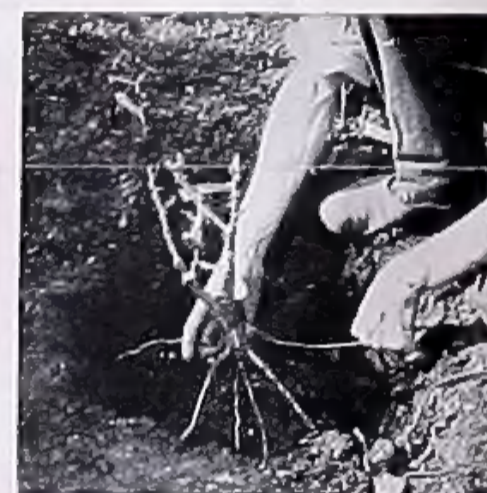
Holding Roots in Position