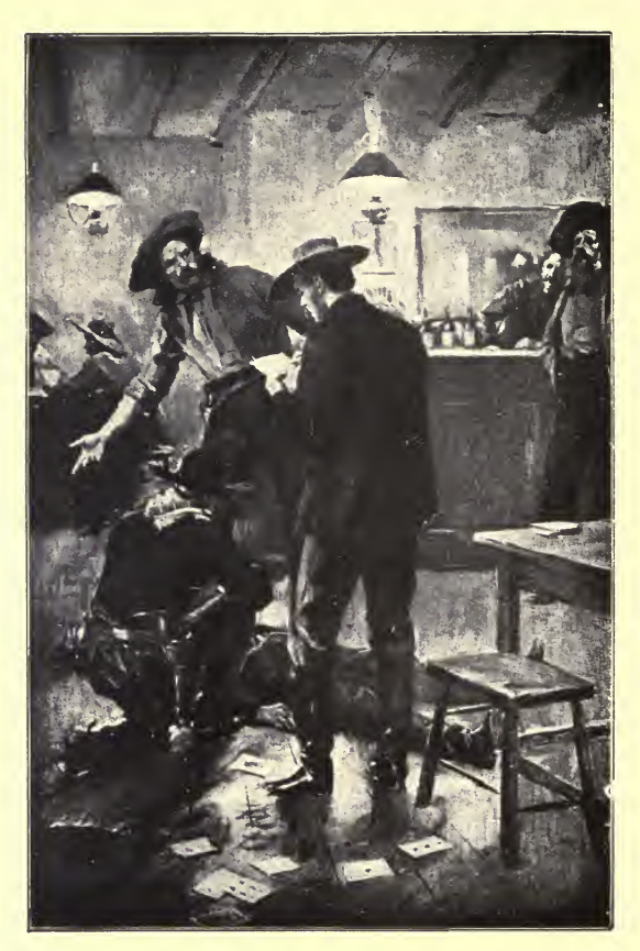
AN INFERIOR SORT OF A MURDER