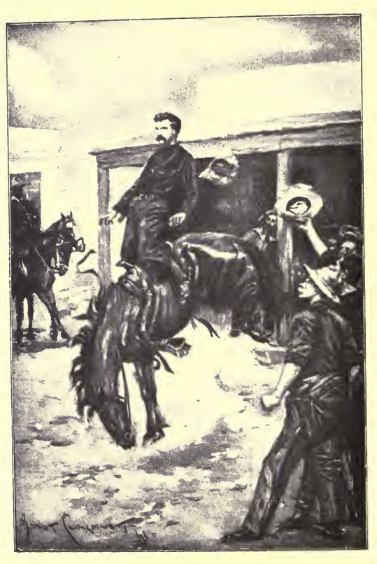
RIDING A BUCKING BRONCHO