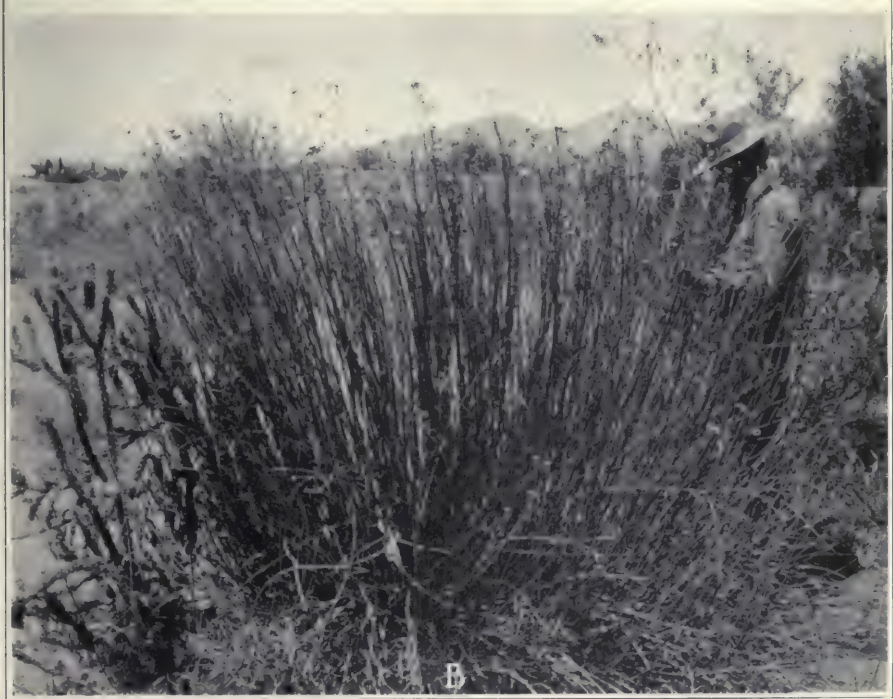
A. Community of Asclepias subulata in an arroyo near Mesa, Arizona. B. Individual plant of A. subulata , showing maximum size in nature.