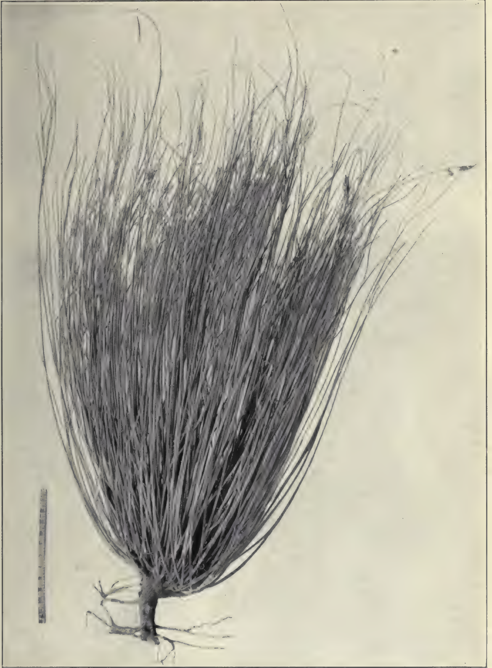
Asclepias subulata , collected at Sentinel, Arizona. Plant 5 feet high.