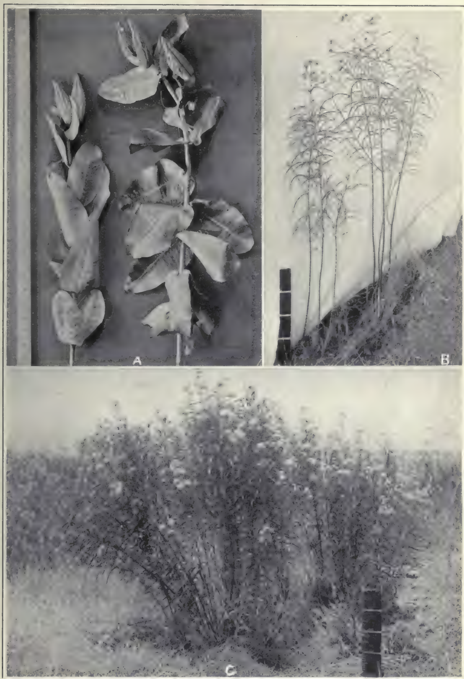
A. Asclepias sullivanti , collected at Lincoln, Nebraska. B. Asclepias mexicana , growing near Dos Palos, California. C. Community of A. mexicana , near Dos Palos. The plant in the foreground is 6 feet high.