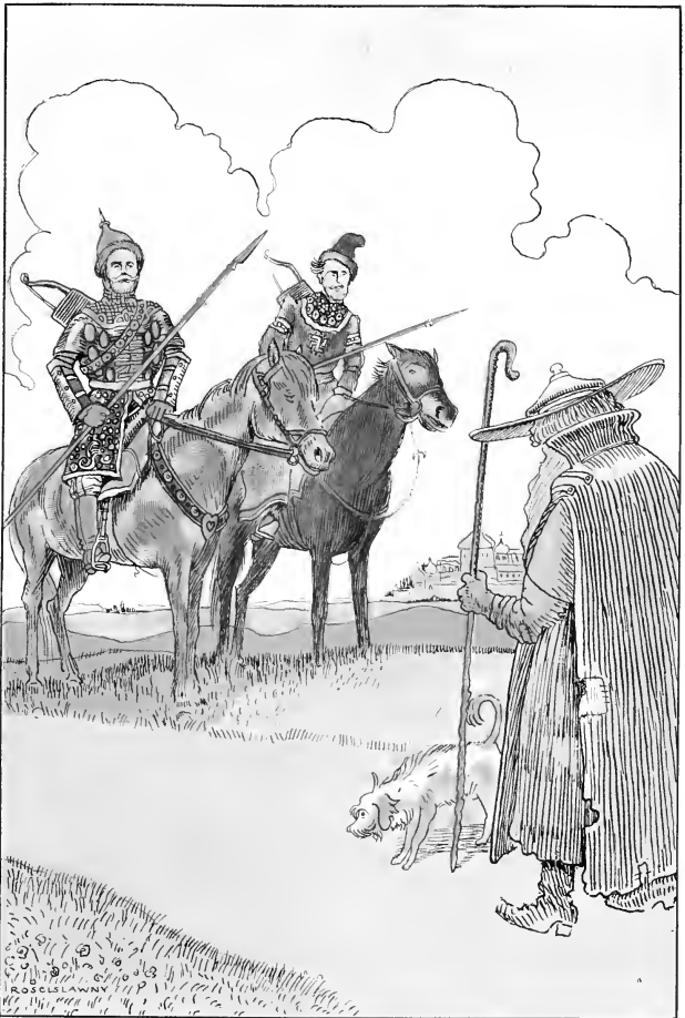
AT LENGTH THEY FELL IN WITH A CRIPPLE ON THE ROAD.