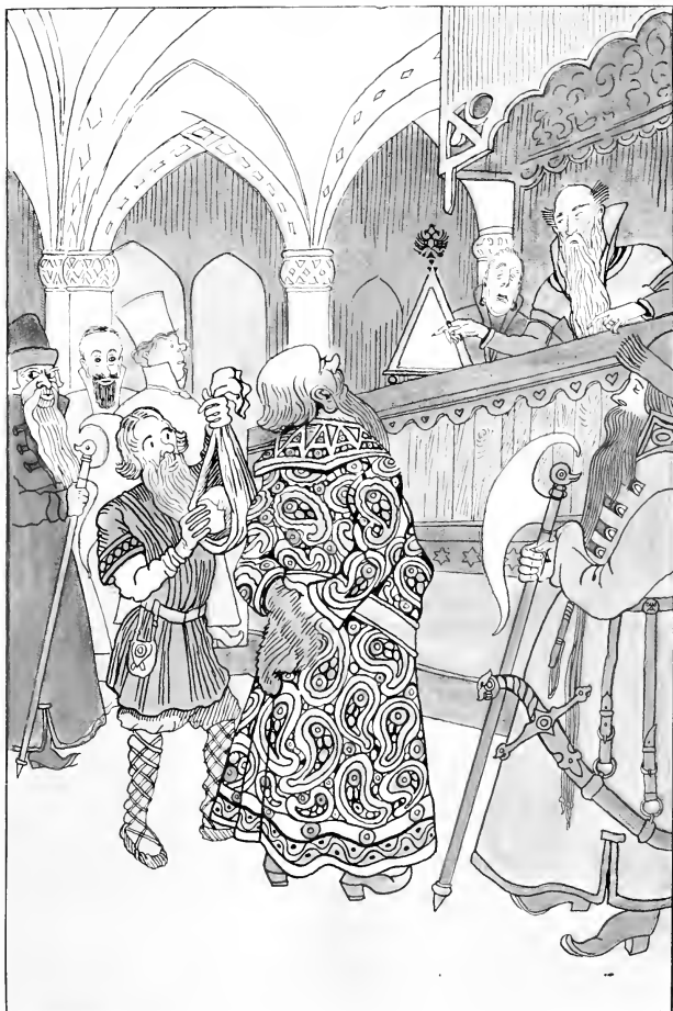
THE JUDGE THOUGHT THAT THE BUNDLE WAS FULL OF ROUBLES.