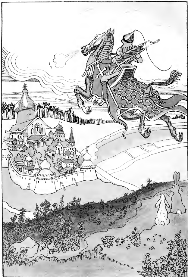
THE HORSE GREW RESTIVE, REARED HIGHER THAN THE WAVING FOREST.