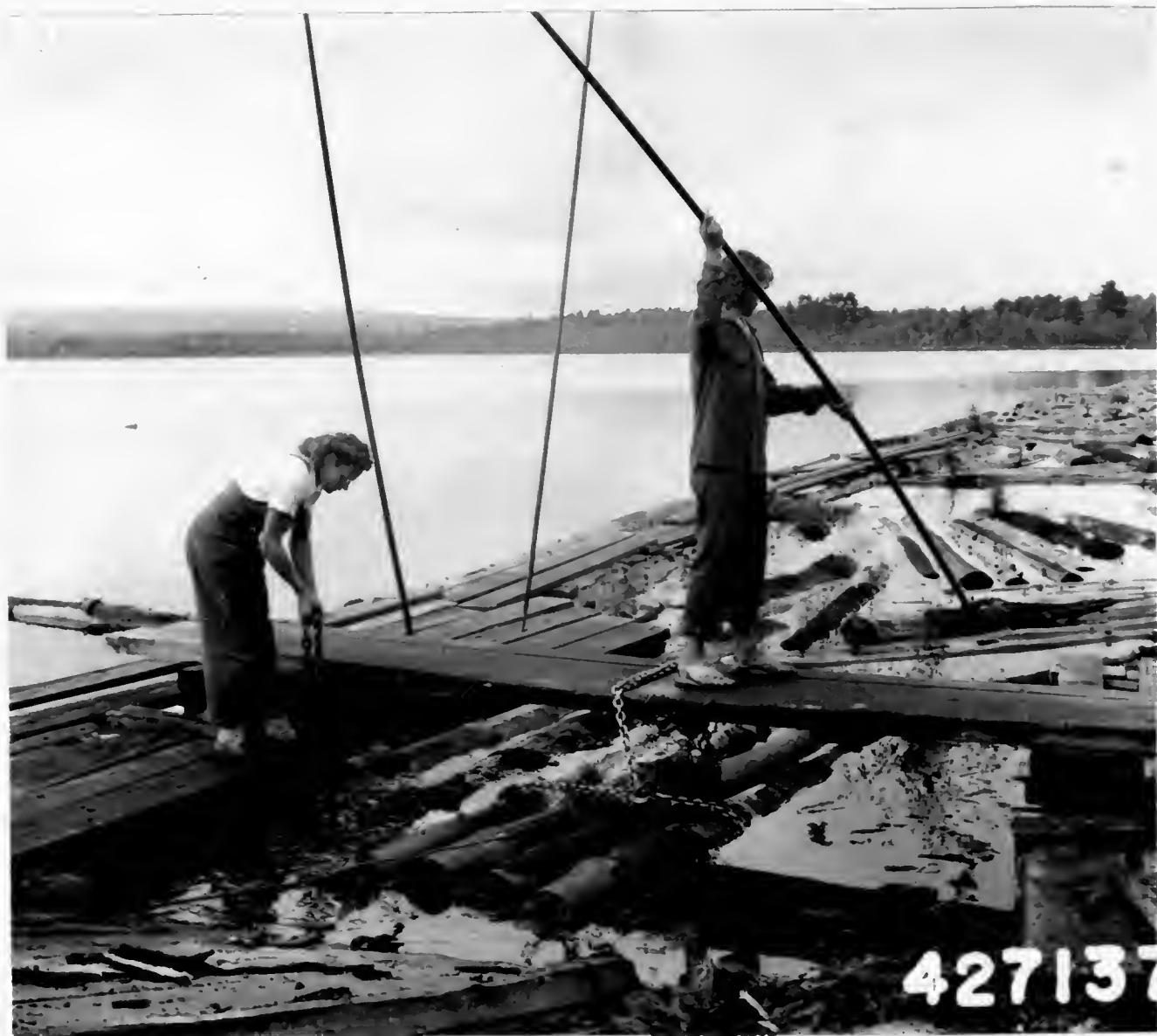
Turkey Pond Sawmill located near Concord, N.H. Mill operated by NETSA and run by 9 women and 3 men.

August, 1943 U-Saw Prod., Lbr., Mills & Log Stor.--N.H.