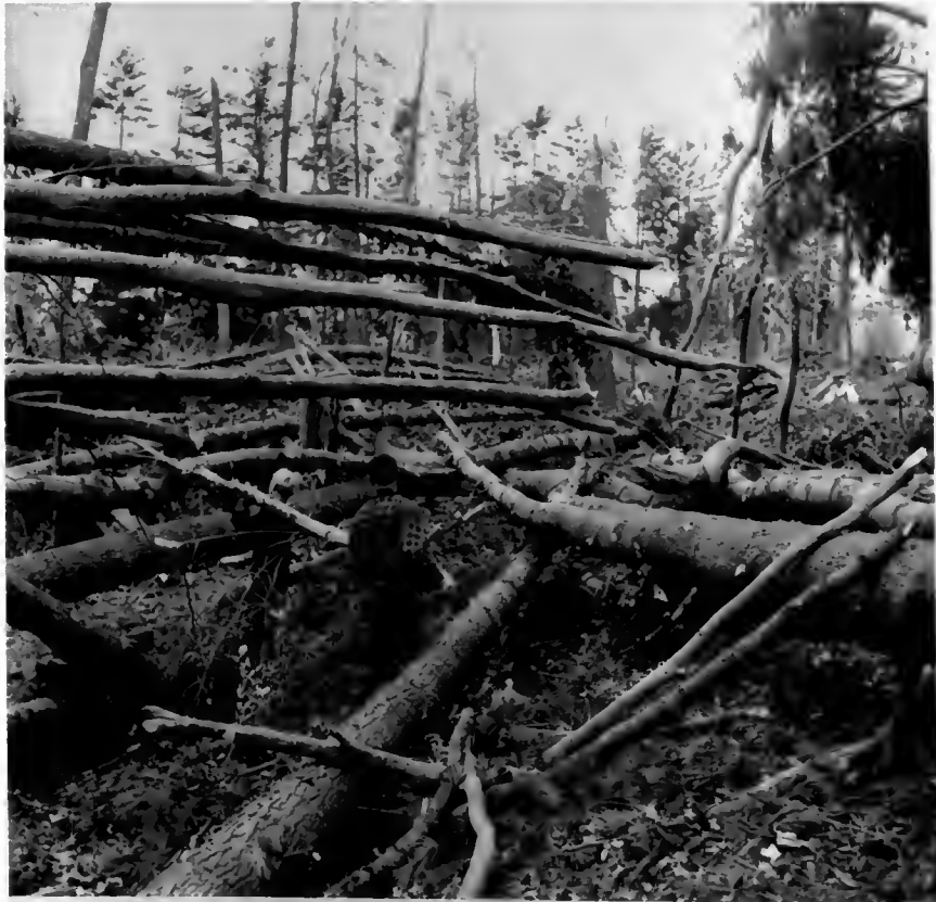
A WPA clean up crew reducing the fire hazard at Lady Wheelock and Lady Parks at Keene, New Hampshire, caused by the storm of September 21, 1938. October, 1938