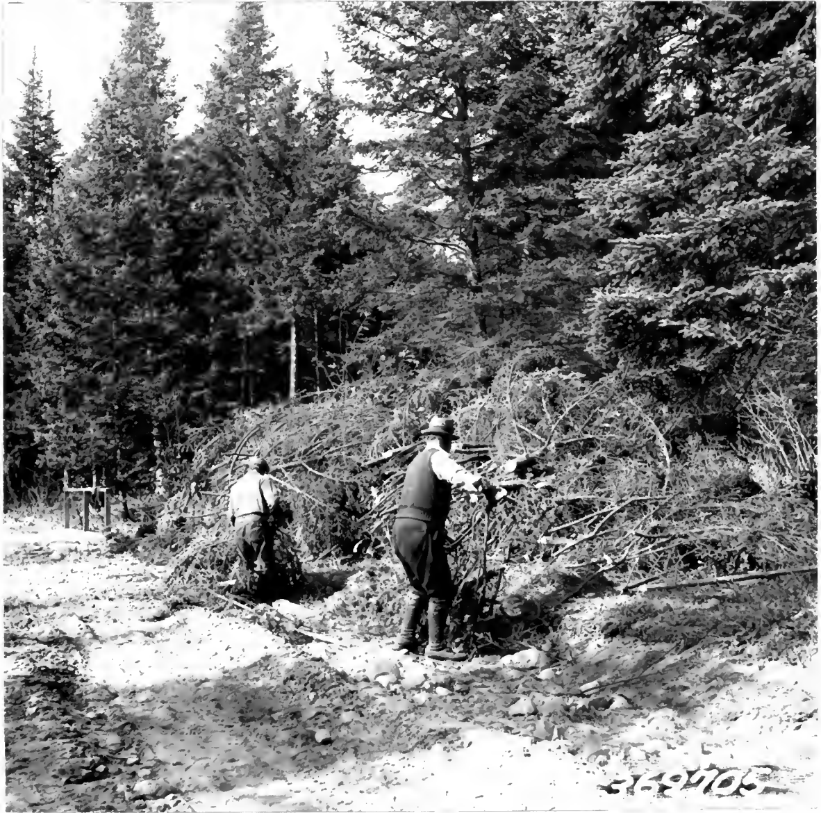
Timber Management, Injured Trees, New Hampshire, White Mountain National Forest W. P. A. workers piling brush tops and slash cuttings from devastated trees in the Gale River Experimental Forest along the side of the Gale River State Road.