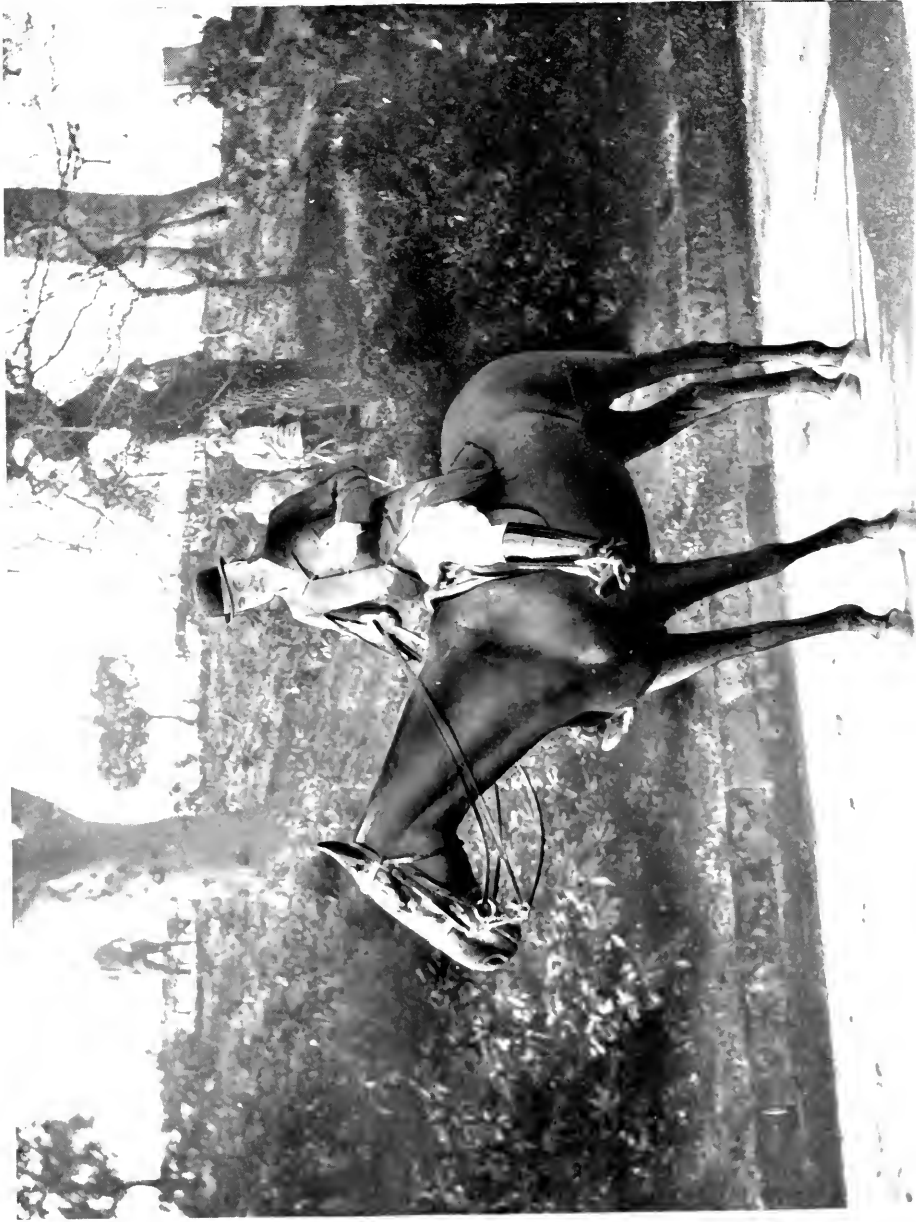
April, 22nd, 1921. Hurworth Hounds met at Thimbleby Hall, found on Black Hambleton, ran fast over moors to ground not far from Rievaulx Abbey; very bright day. Twenty-seven miles ride home; beautiful evening.